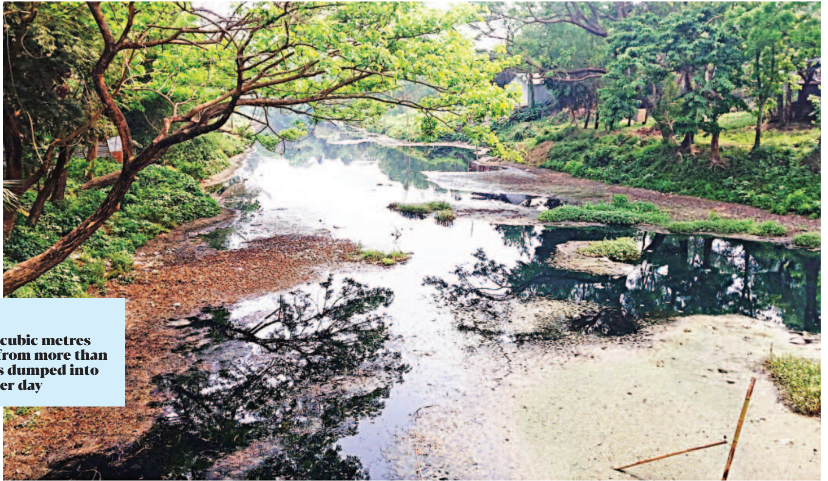
The Louhajang river in Tangail is choking on toxic waste from factories in BSCIC Industrial Area. The heavily contaminated water is destroying the aquatic biodiversity and making life difficult for the locals. The photo was taken from Khudirampur in Sadar upazila recently.

RIVER POLLUTION About 60,000 cubic metres of toxic waste from more than 7,000 factories dumped into Dhaka rivers per day