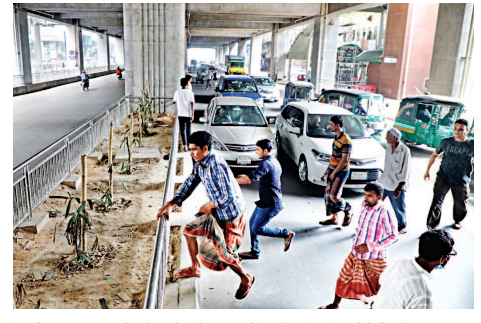
Pedestrians rush towards the median amid speeding vehicles on the capital's Kazi Nazrul Islam Avenue, risking lives. The photo was taken around 4:00pm yesterday, beneath the MRT station in Karwan Bazar which has a footbridge for crossing over.

"BNP leaders should unconditional apology before the nation their undemocratic SEE PAGE 4 COL 5