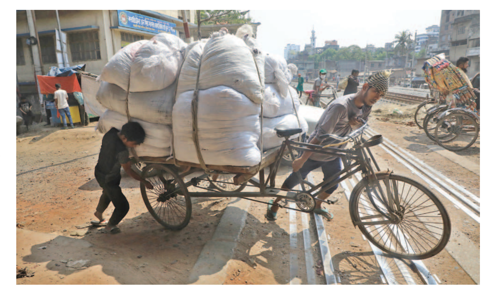
Two people struggle to get an overloaded rickshaw van across a level crossing in Dhaka's Sayedabad. Vehicles often get stuck on this level crossing due to its poor condition. The photo was taken on Sunday.

He said the US-Bangladesh partnership plays an important role in ensuring a free, open, secure, SEE PAGE 6 COL 1