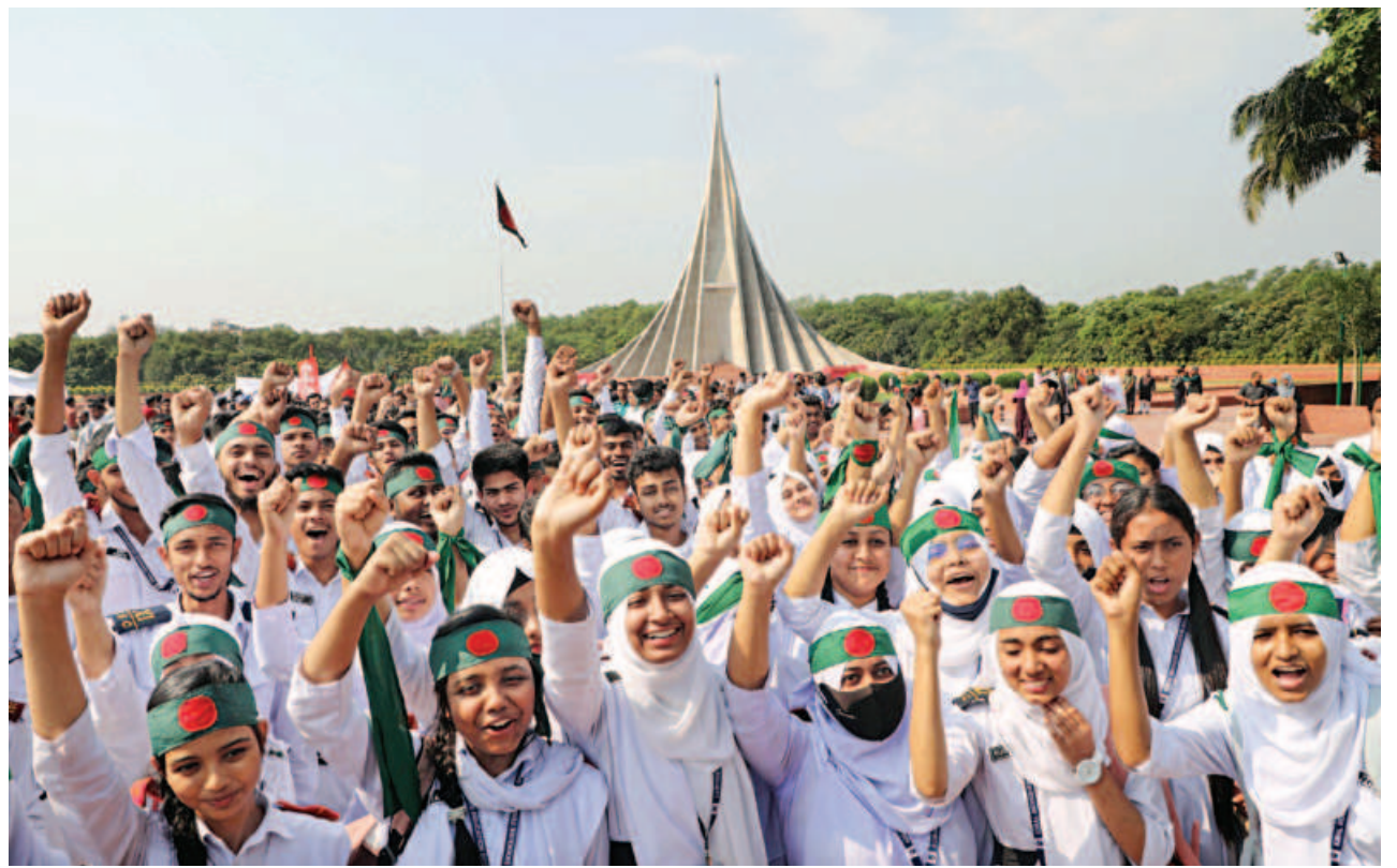
Like every year, the students of Gazipur's Iqbal Siddiquee College visited the Jatiyo Smriti Shoudho, otherwise known as the National Martyrs' Monument, in Savar to commemorate Independence Day yesterday.