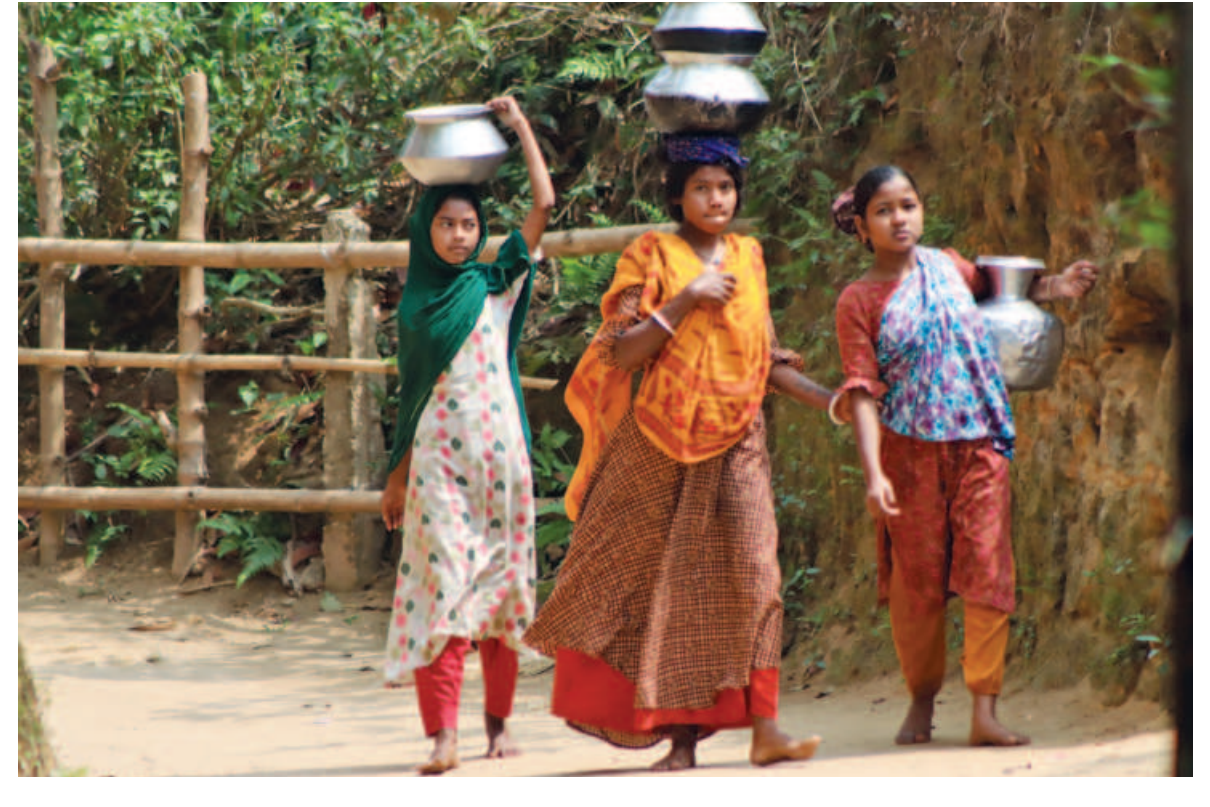
After collecting water from a distant well, three tea workers walk back home at Lakkatura tea garden in Sylhet Sadar yesterday afternoon. Due to water scarcity being a regular problem in the area, hill dwellers, especially women, have to engage in this labourous task on a daily basis.