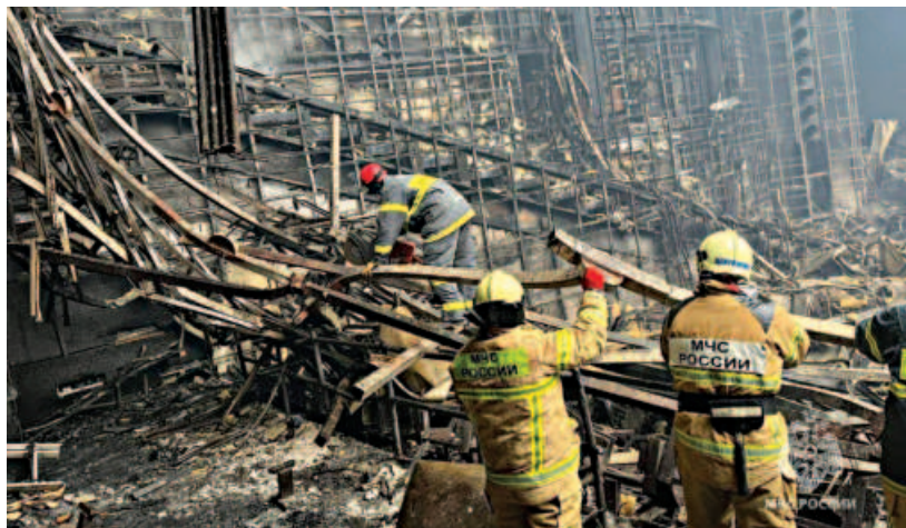
This handout photograph taken and released by Russian Emergency Ministry yesterday shows rescuers working inside the Crocus City Hall, a day after a gun attack in Krasnogorsk, outside Moscow.