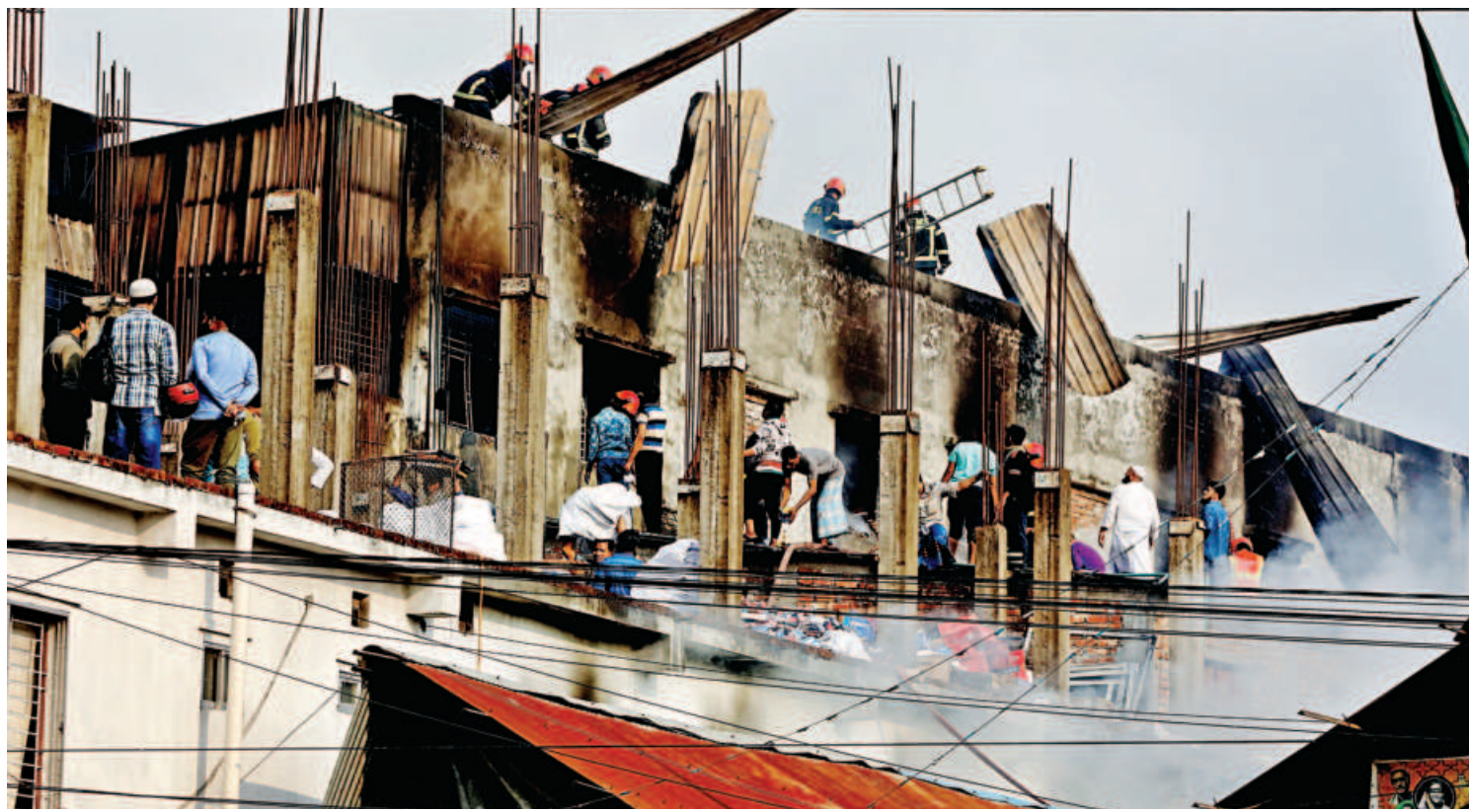
Ten units of firefighters work together to douse a fire that broke out at a warehouse in the Bhanga Press area of Dhaka's Demra around 11:30pm on Thursday night. After eight and a half hours, the fire was finally brought under control and subsequently doused around 11:50am. The photo was taken yesterday.

Filing of a case was underway, the OC added.