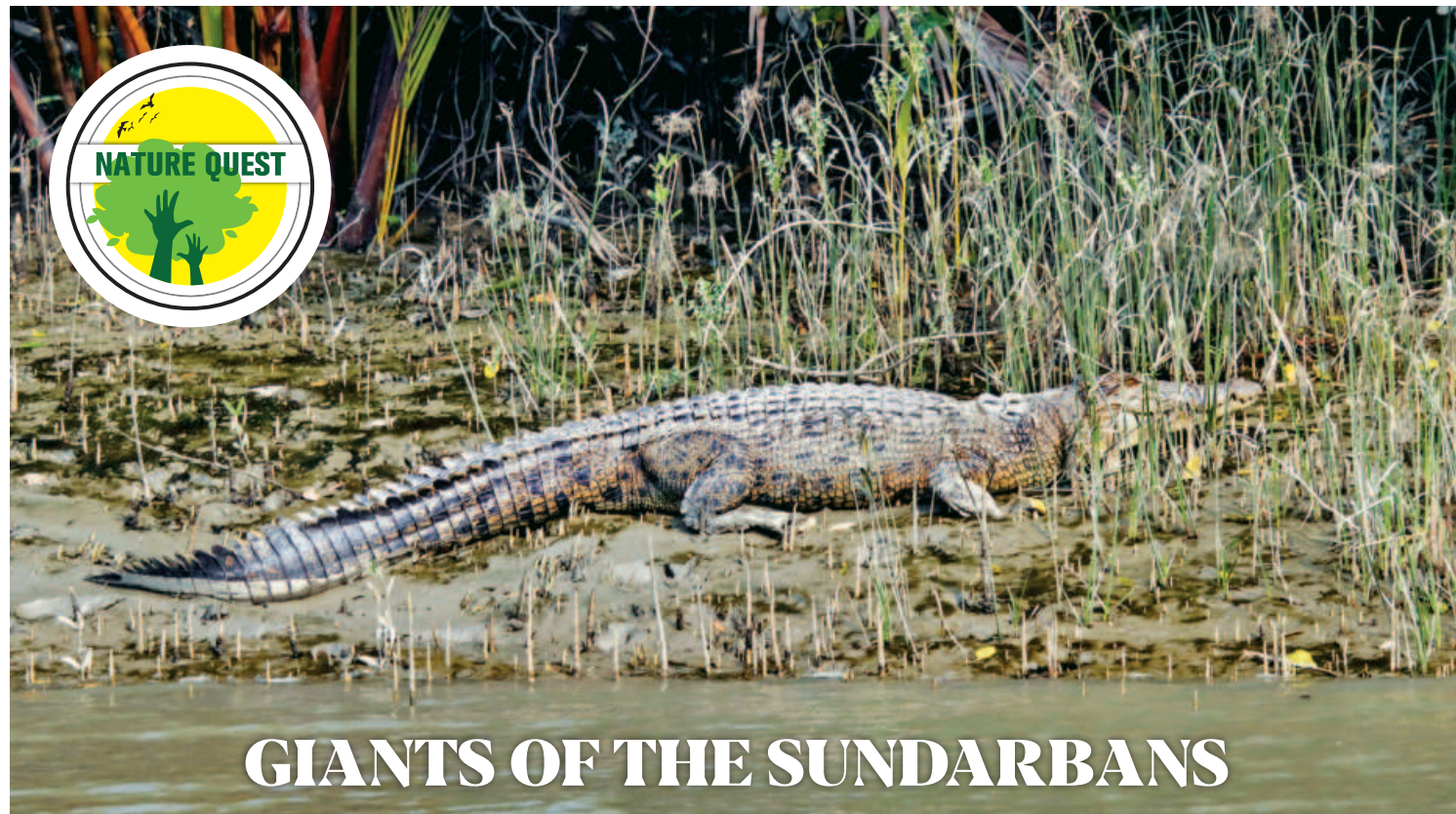
GIANTS OF THE SUNDARBANS A saltwater crocodile spotted roaming the Sundarbans recently. Native to saltwater habitats, brackish wetlands and freshwater rivers, saltwater crocodiles are known as the largest living reptiles in the world. As a matter of fact, these opportunistic carnivores can prey on almost any animal that enters their territories, including sharks and humans. They often ambush their prey and swallow it whole. What is more interesting is that saltwater crocs have been found to sleep with one eye open, keeping one half of the brain awake and alert for predators. These giant but majestic beasts of the seas are often threatened by illegal killing and habitat loss, pushing them to the brink of endangerment.