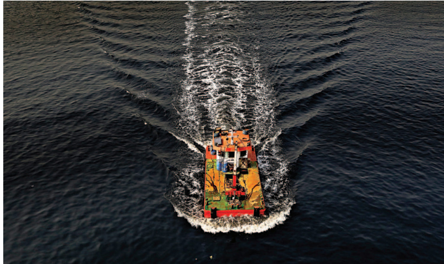
RIPPLES OF POLLUTION ... As a vessel plies the Buriganga, the blackened ripples show proof of the intense pollution that the river is choking on. Once a mighty thriving river, it has now become a dumping ground. Surrounding factories and homes release various pollutants, including toxic chemicals, harming the biodiversity in and around the river. On this World Water Day, it is imperative to remember that the rivers are the country's lifeline.

3 MORE STORIES ON WORLD WATER DAY -- PAGE 3