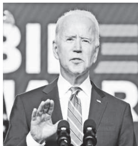
Joe Biden would assume office at the age of 81 if re-elected, while Donald Trump, if successful in securing re-election, would be inaugurated at the age of 78.

However, this tradition was challenged by Franklin D Roosevelt, who secured election to the presidency an unprecedented four consecutive times. The ensuing concerns regarding the potential consolidation of