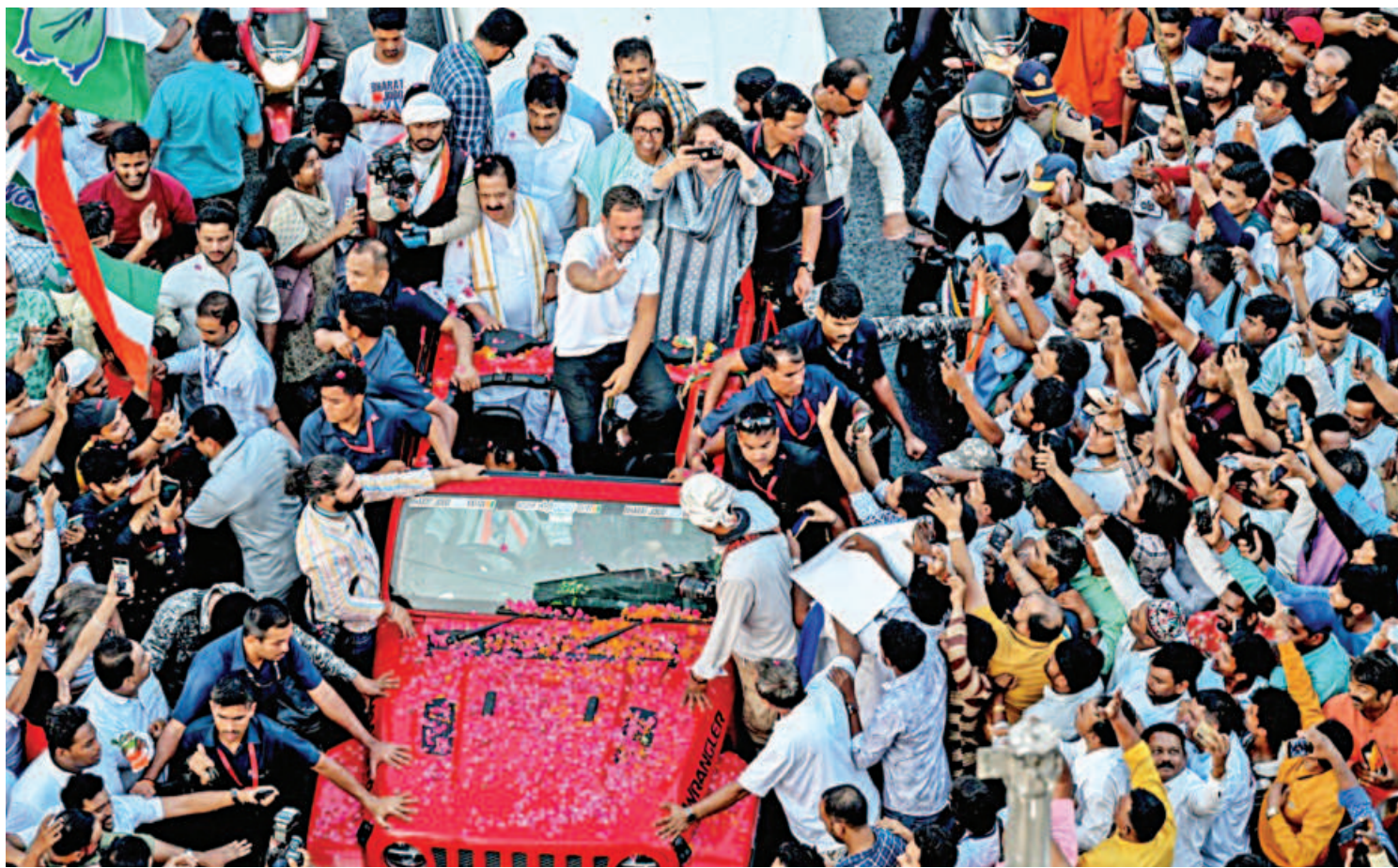
India's Congress party leaders Rahul Gandhi and Priyanka Gandhi Vadra gesture during Bharat Jodo Nyay Yatra roadshow, in Mumbai yesterday.

UN humanitarian chief Martin Griffiths warned in a letter to the Security Council that "almost 5 million people could slip into catastrophic food insecurity in some parts of the country in the coming months."