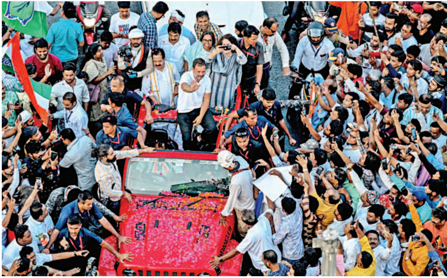
India's Congress party leaders Rahul Gandhi and Priyanka Gandhi Vadra gesture during Bharat Jodo Nyay Yatra roadshow, in Mumbai yesterday.

UN humanitarian chief Martin Griffiths warned in a letter to the Security Council that "almost 5 million people could slip into catastrophic food insecurity in some parts of the country in the coming months."