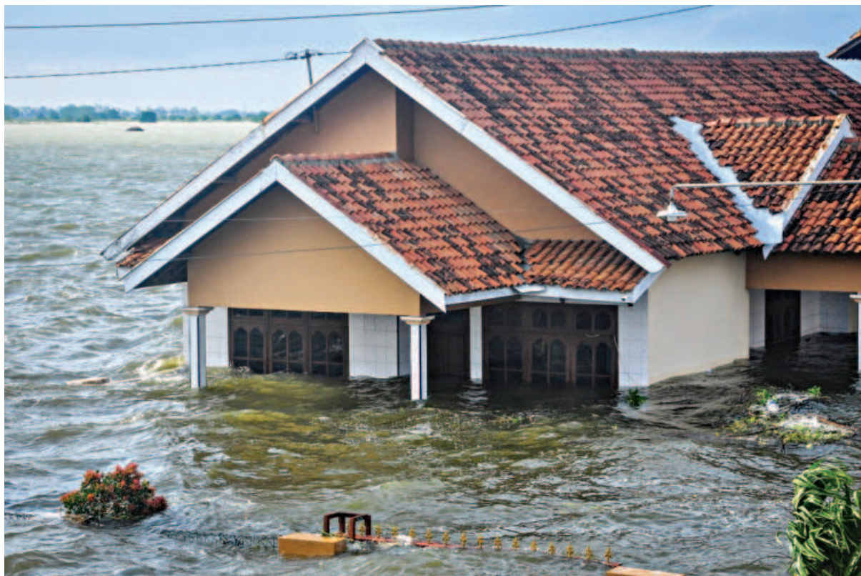
A house is engulfed in flood waters after heavy rains in Tanggulangin, Central Java, Indonesia yesterday.

Tunisian authorities rescued 34 migrants and found two dead bodies off the North African country's southeastern coast on Friday, said the National Guard in a statement. Another 34 people are believed to be missing, they added, after survivors told them that there were 70 on board before their vessel capsized. "We were able to intercept a crossing attempt of the maritime border, rescuing 34 passengers of different nationalities and recovering two bodies," read the statement. The National Guard said it was still searching for the missing passengers. Survivors told authorities they had set sail from "a neighbouring country" before their boat capsized. Tunisia and Libya are the main north African departure points for irregular migrants.