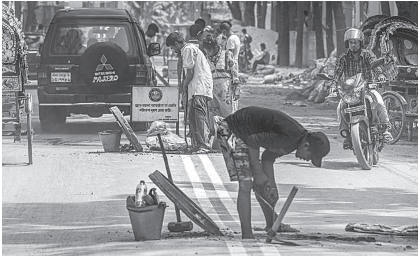
Workers cleaning sewerage lines amid speeding vehicles on avenue-2 in Chondrima Model Town area of the capital's Mohammadpur yesterday afternoon. Their lack of safety gear and absence of demarcation around the open manholes further exacerbates the risks.

A champion (singer) of BTV's defunct Notun Kuri show, Afreen completed bachelor's and master's degrees from Jahangirnagar University. She was buried at Borkotpur graveyard in Badda after the Zohr prayers.