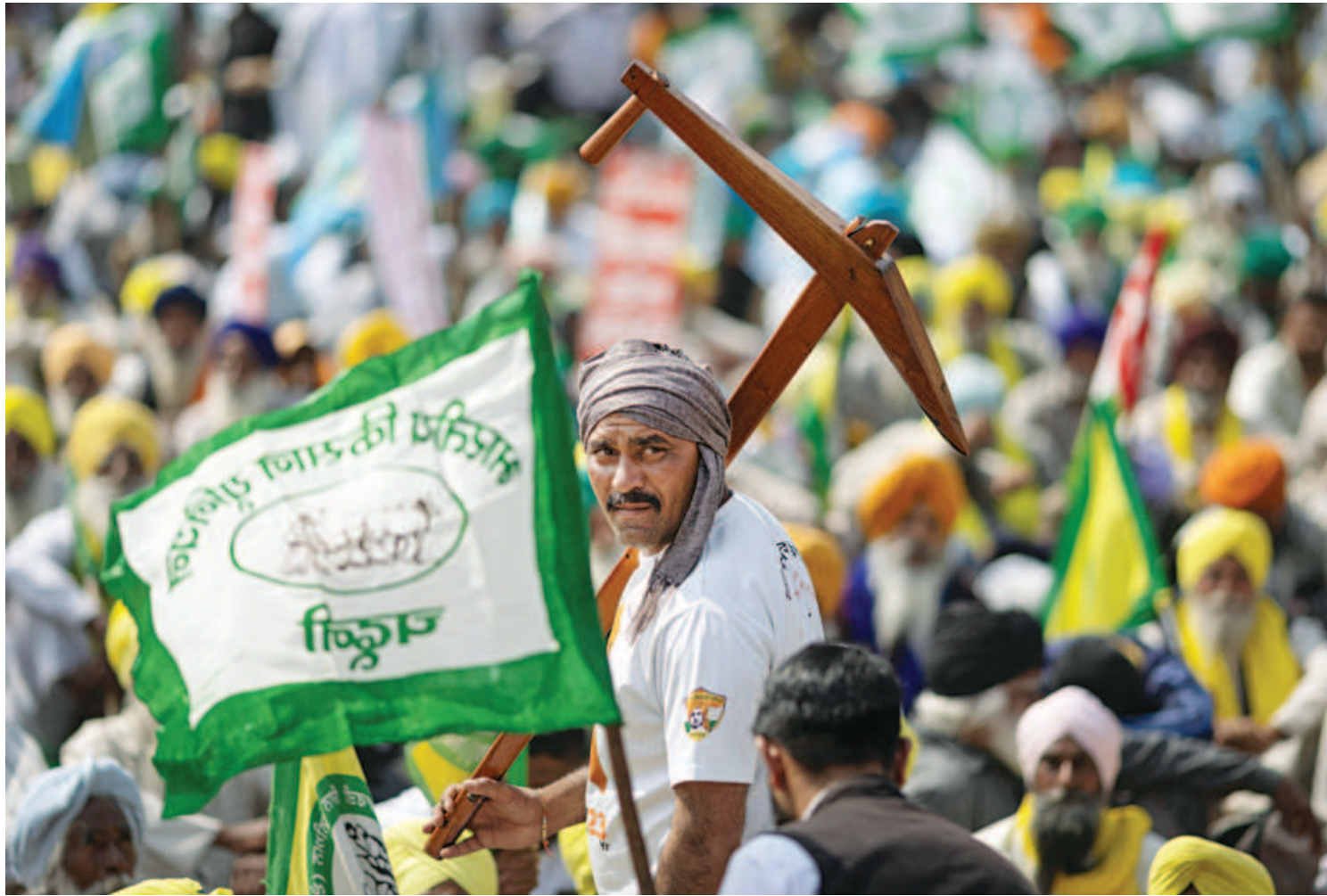
A farmer holds a mock plough as he attends a Maha Panchayat or grand village council meeting as part of a farmers' protest to press for the better crop prices promised to them in 2021, in New Delhi, India, yesterday.

"Rosgvardia units are involved in repulsing an attack by enemy diversion groups near the village of Tyotkino in the Kursk region," the national guard said yesterday.