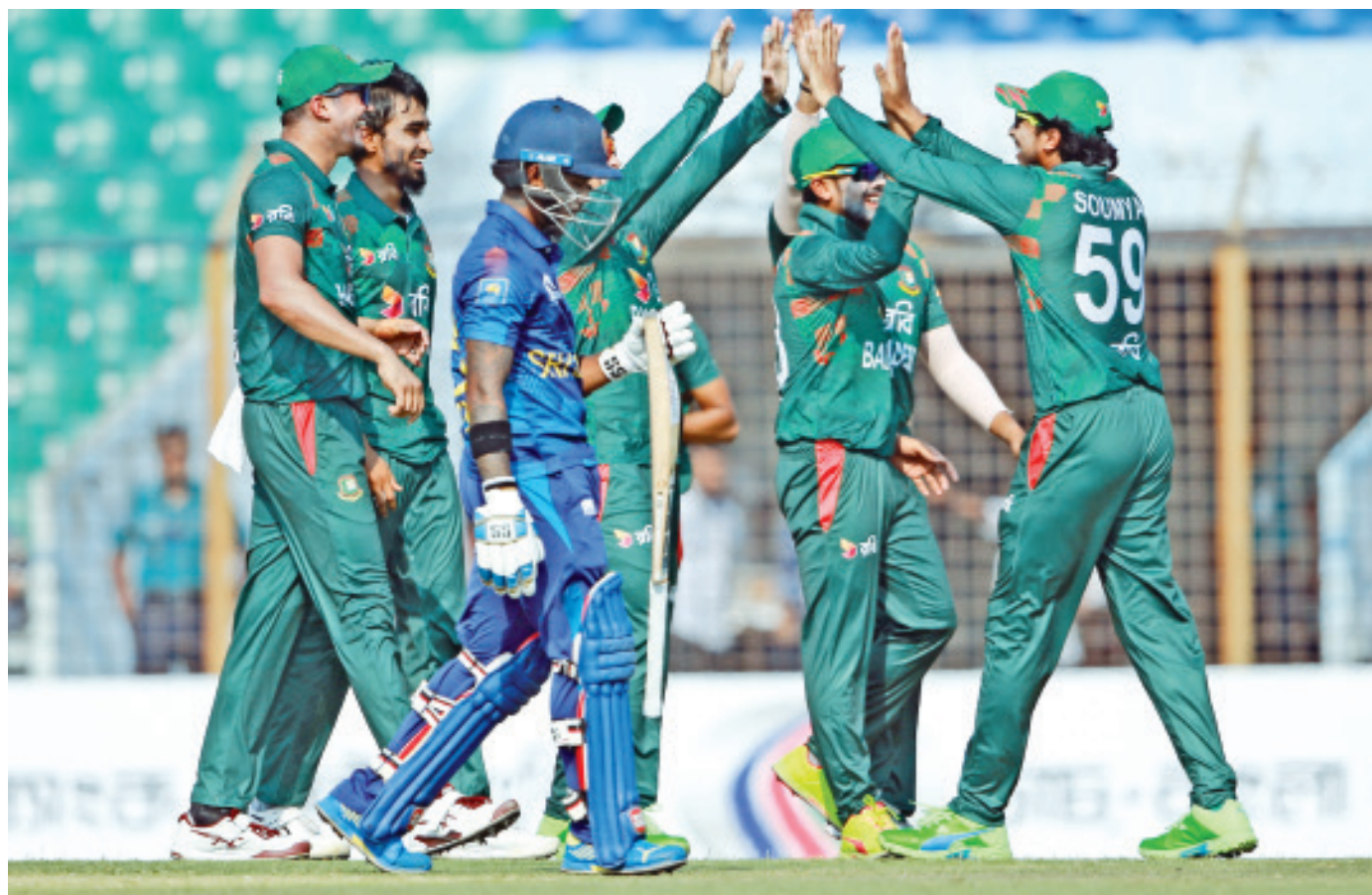
Pacer Tanzim Hasan Sakib celebrates with teammates after dismissing Sri Lanka opener Pathum Nissanka in the first of the three-match ODI series in Chattogram yesterday. After the visitors got off to a smooth start, it was Sakib who pegged them back with three quick wickets before the Bangladesh bowlers eventually managed to tighten the grip.

Shanto's 62-ball 69 fourth-wicket stand with Mahmudullah, who scored a run-a-ball 37, brought things under control before Mushfiqur and Shanto's unwavering and calculative partnership saw them home.