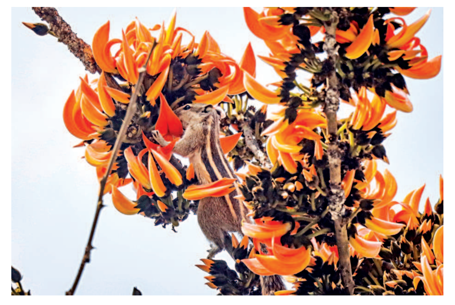
Jumping from one palash flower to another, a squirrel finally rests as it comes across nectar. Holding onto the flower delicately, it sips the sweet delight in contentment in Khulna University campus area yesterday morning.

of Karmojibi Nari and Creative Pathways Bangladesh.