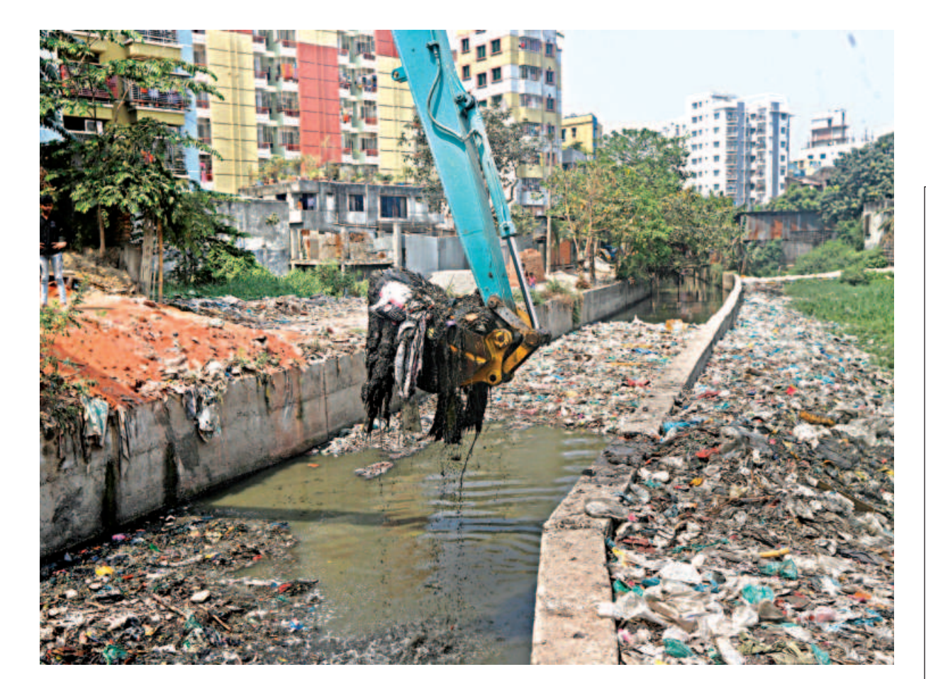
Non-biodegradable wastes being scooped out of the Khilgaon-Basabo canal with a bulldozer in the capital's Madinabagh area yesterday afternoon. The measures were taken to prevent waterlogging in its surrounding areas, ahead of expected rains during summer and monsoon.

My son has been working on ships since 2008. I have seen news of Somali pirates hijacking ships before. But I never thought my son would have to see such a day.