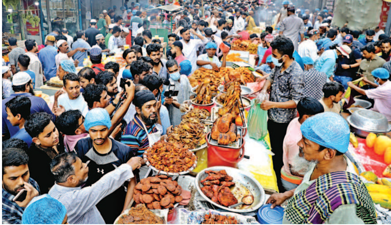
During the month of Ramadan, the capital's Chawkbazar might as well be dubbed "the iftar street". Throughout the month, the sprawling market in the heart of old Dhaka sell a variety of iftar goodies, starting from peyajus and begunis to chicken parathas and lamb roasts. Customers from all parts of the city come to this spot almost every day to get their hands on their favourite items. The photo was taken yesterday.