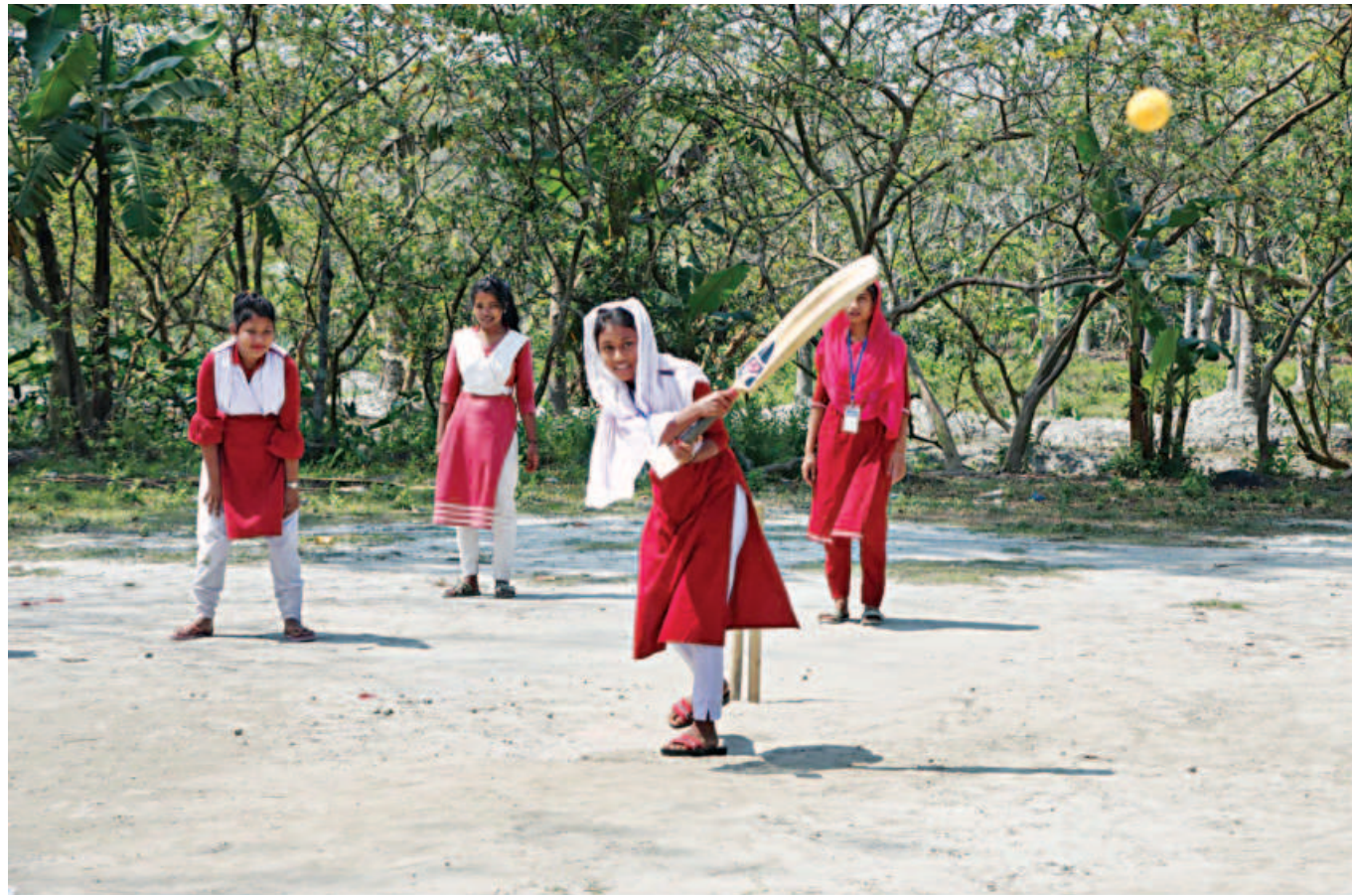
FUTURE TIGRESSES? ... The girls of Atghar Secondary School in Pirojpur's Nesharabad upazila were seen engaged in a game of cricket during recess yesterday. Girls' participation in sports has increased over the past few years with Bangladesh womens' football and cricket teams bringing home accolades and inspiring future generations.