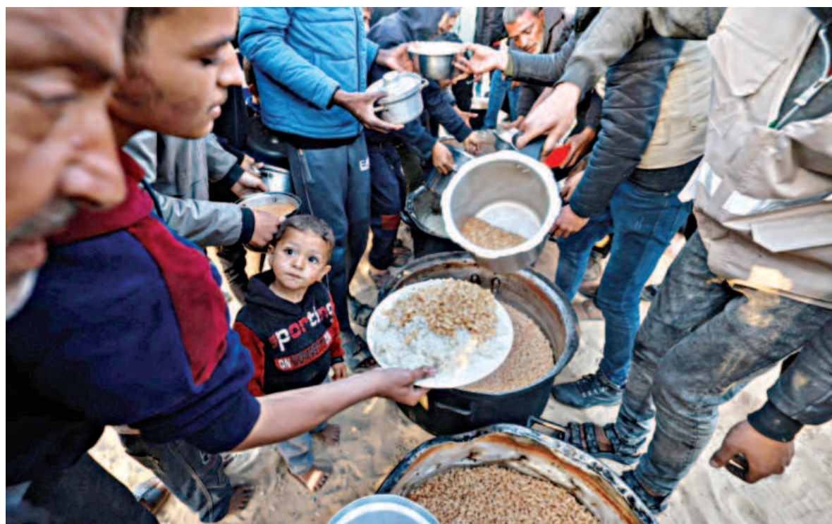
Displaced Palestinians collect food donated by a charity before an iftar meal, the breaking of fast, on the first day of the holy month of Ramadan, in Rafah in the southern Gaza Strip yesterday amid Israeli strikes on the besieged enclave.

Many among India's 200 million Muslims fear the law is a precursor to a national register of citizens that could leave them stateless in the country of 1.4 billion.