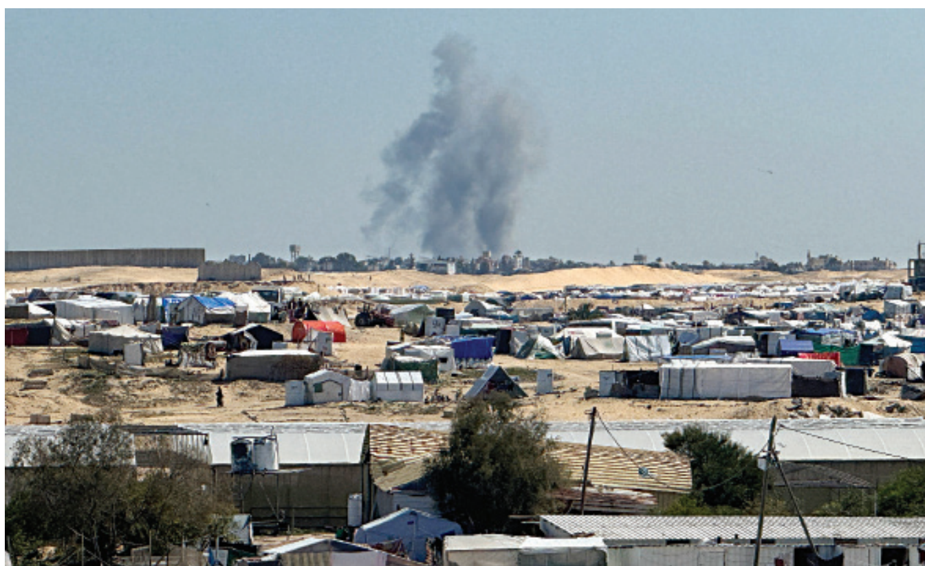
Smoke rises during an Israeli ground operation in Khan Younis as seen from a tent camp sheltering displaced Palestinians in Rafah, in the southern Gaza Strip yesterday.

At least 8,000 people were killed by fighting or war-related causes during the siege, one of the biggest battles of the nearly two-year war between Russia and Ukraine, the Human Rights Watch said in February.