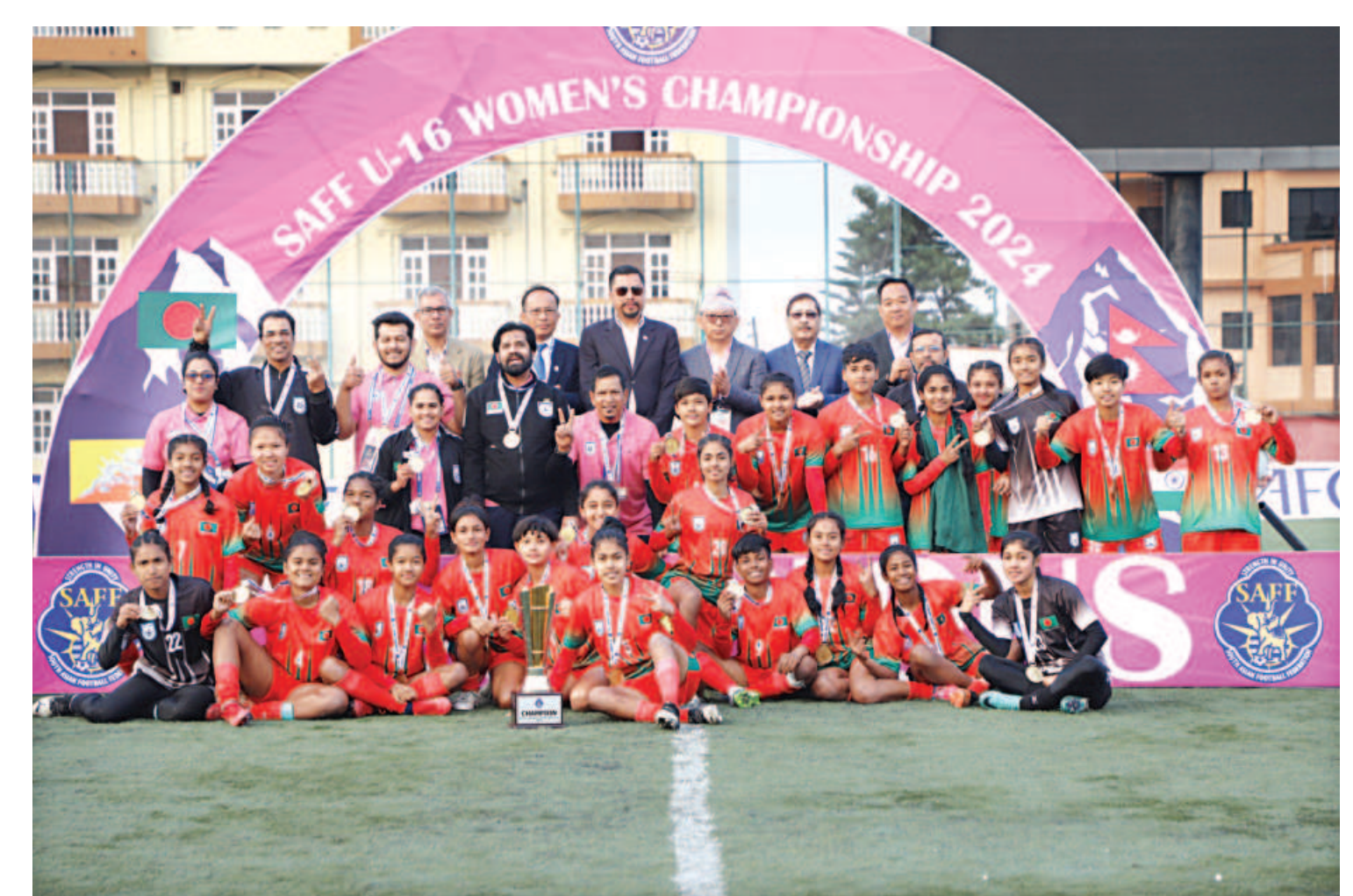
Bangladesh players and members of the team management celebrate with the trophy after a 3-2 win on penalties over India saw the young girls regain the SAFF Women's U-16 Championship following a gripping final at the ANFA Complex Stadium in Kathmandu yesterday.

In accordance with Mujib's request for a political solution, the American Consul General in Dhaka SEE PAGE 6 COL 5