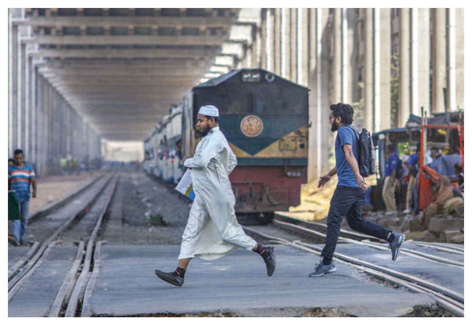
As if a mere minute saved could rewrite their destinies, two men gamble with life as they sprint across the railway lines at Mohakhali level crossing while a train approaches at speed.