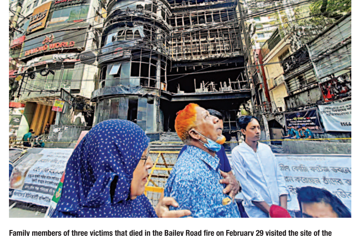
tragedy yesterday. They demanded a fair investigation, alongside justice and punishment for those responsible for the incident.

during the drive. The restaurants have been asked to present necessary documents to Rajuk for inspection, he