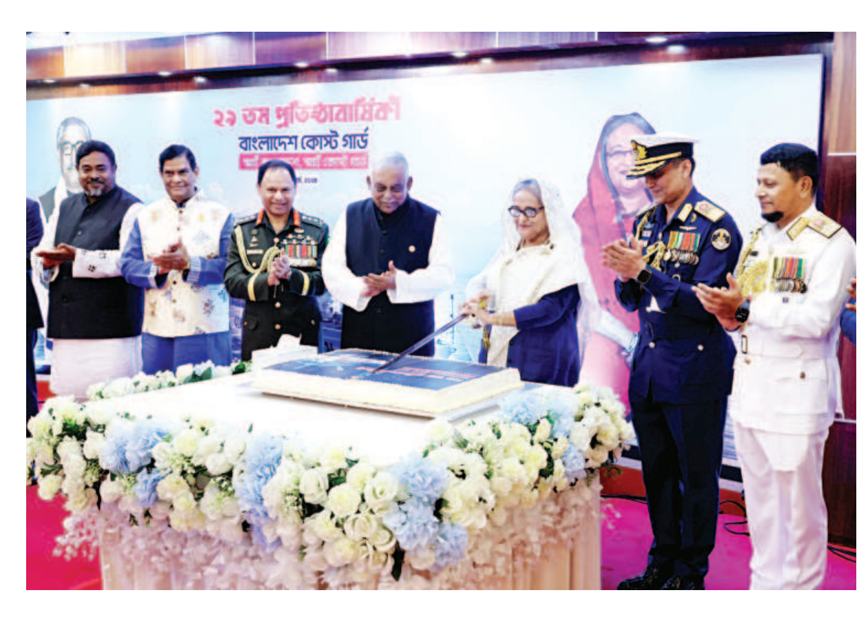
Prime Minister Sheikh Hasina cuts a cake at a programme, marking the 29th founding anniversary of Bangladesh Coast Guard, at BCG headquarters in the capital's Agargaon, yesterday.