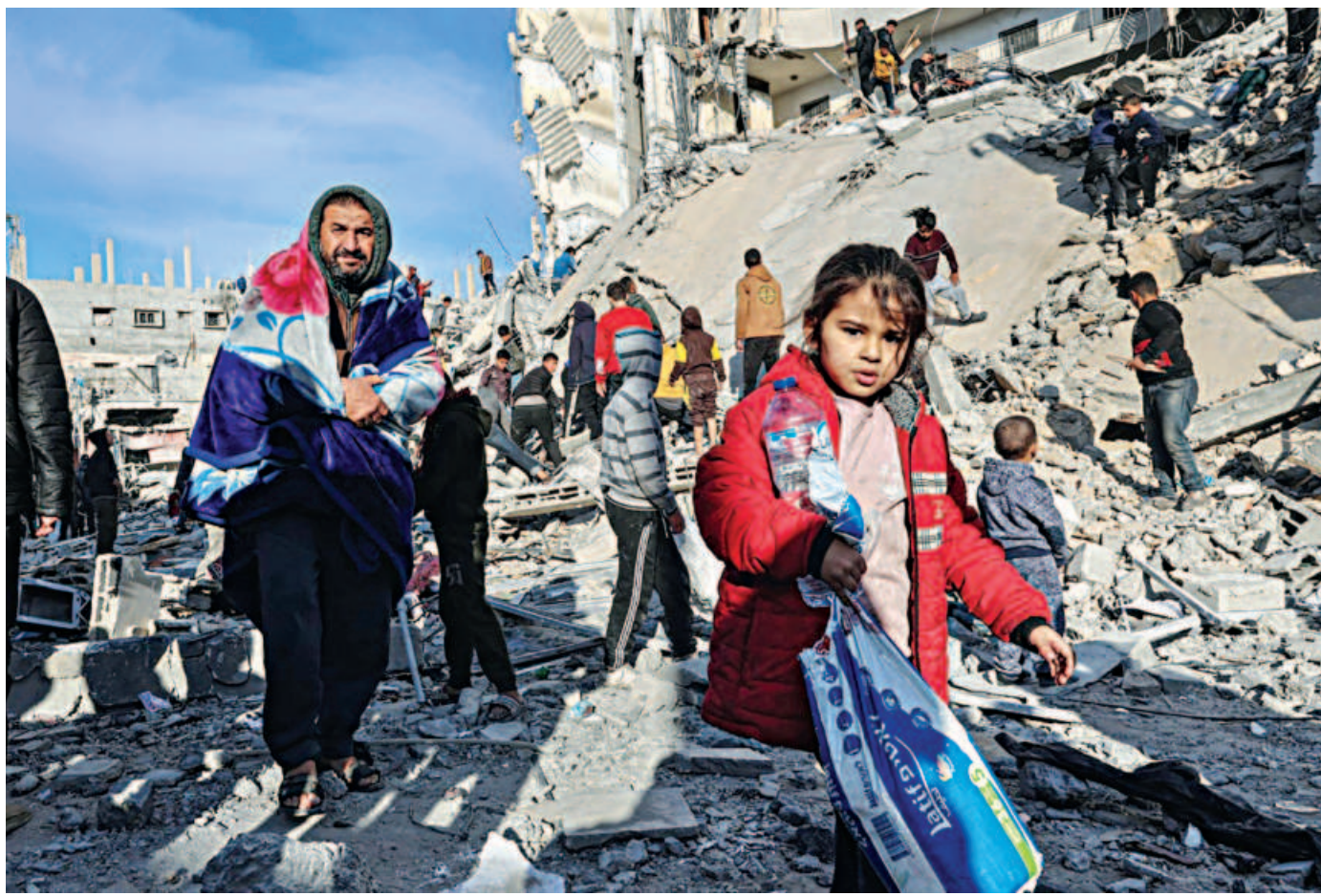
Palestinians walk away with some items salvaged from the rubble of a residential building hit in an overnight Israeli air strike in Rafah in the southern Gaza Strip yesterday.