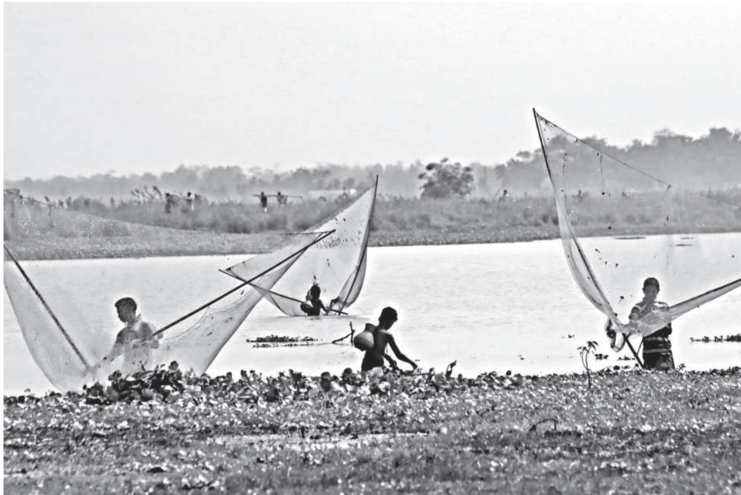
Fishers cast 'Haata Jaals', a local fishing net used to catch small fish varieties, in the shallow waters of Phulbari Beel in Sylhet's Kanaighat upazila yesterday morning.

Meanwhile, Gathia Roy, 44, of Konsopara village under Dinajpur's Birganj upazila, died after a cattle-loaded truck ran him over around 4:15pm near Jodur Moore area on Panchagarh-Dinajpur highway, said Anwar Hossain, sub-inspector of Birganj Police Station.