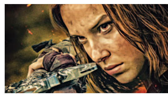
Amazon Prime Boat Story