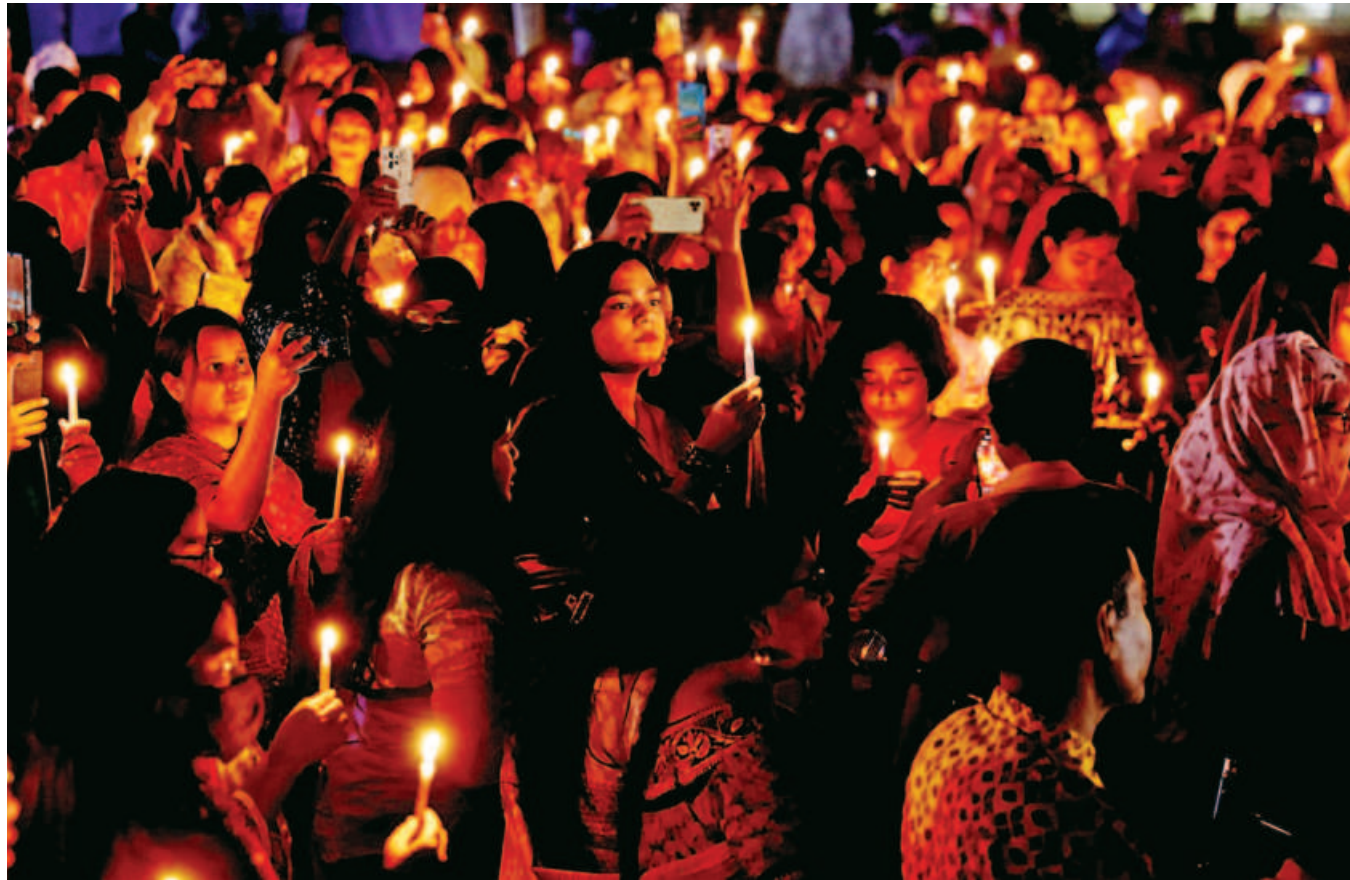
Women hold a candlelight vigil at the Central Shaheed Minar as the clock struck 12:00am today to mark the International Women's Day, which is being observed across the world with the theme "Invest in women: Accelerate progress". The event was organised by WE CAN Bangladesh.