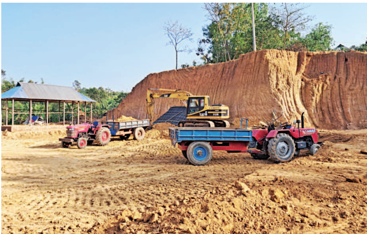
Hills being cut by a syndicate, led allegedly by a local influential, in Brahmanbaria's Kasba upazila. Locals have claimed that the gang has long been cutting hills in broad daylight and selling the soil for illegal gains. According to the Environment Protection Act, no one is allowed to cut hills without permission from the DoE. However, the upazila administration seems to have turned a blind eye towards this practice that is degrading the environment. The photo was taken recently.