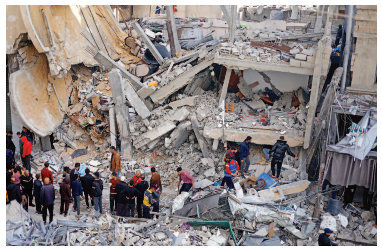
Palestinians gather at the site of an Israeli strike in Rafah, in the southern Gaza Strip yesterday.

He said, "While I condemn any form of political violence, I urge a swift review of all these cases, with a view to their release, to encourage political dialogue and reconciliation."