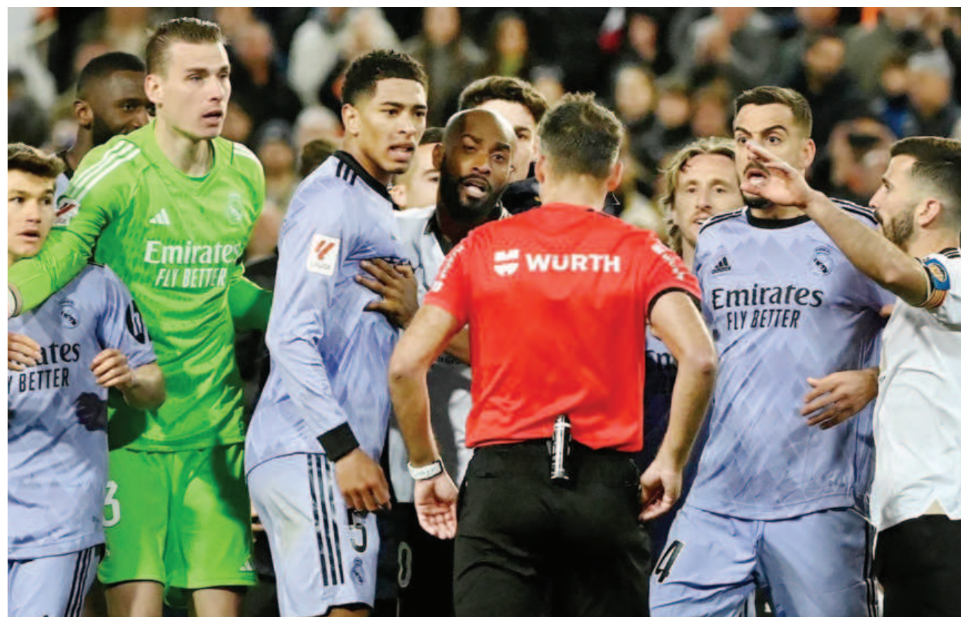
Tempers flared at the Mastella on Saturday as hosts Valencia and Real Madrid played out a 2-2 draw in a LaLiga clash. Vinicius Jr, returning to a stadium where he was racially abused last year, scored a brace to help Real fight back from two goals down, and the league leaders could have walked out as winners had it not been for a controversial decision right at the end of the game. Jude Bellingham was shown a red card following a protest after referee Jesus Gil Manzano blew for time an instant before the English midfielder hit what would have been a 99th-minute winner. Madrid players, coaches, and substitutes flooded the pitch to confront the referee Jesus Gil Manzano.

**Read full stories on The Daily Star website