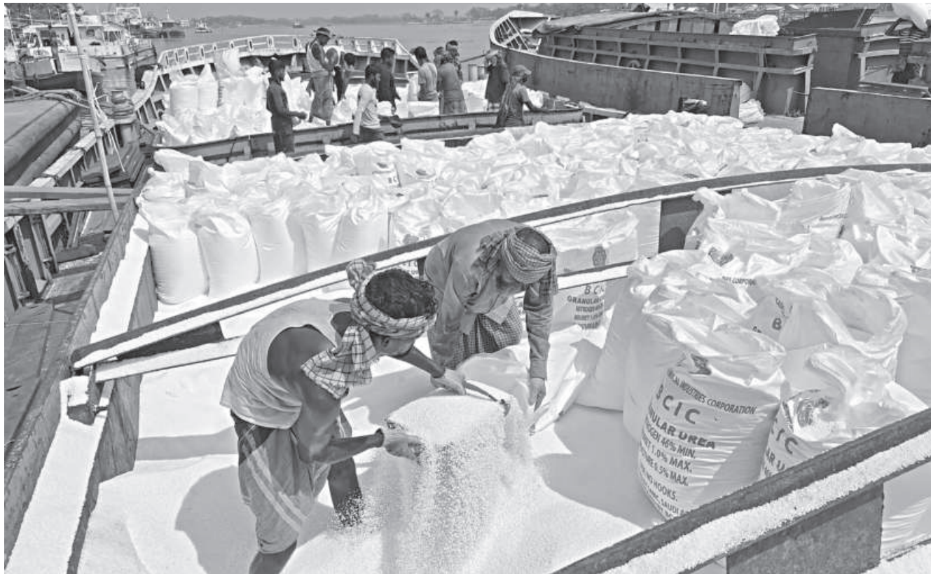
Through Mongla Port, urea fertiliser is imported from Saudi Arabia to the Bangladesh Chemical Industries Corporation's office on Bandh Road in Barishal. Workers unload the fertiliser from cargo ships and transfer it to the warehouse to be used in crop and vegetable cultivation. They are compensated with a daily wage ranging from Tk 600 to 800, with their work hours extending from 6:00 am to 6:00 pm. The picture was taken yesterday.

Amlendu Banik, an adviser of the Durga Puja Festival Committee, filed a case with Raozan Police Station, accusing the seven people.