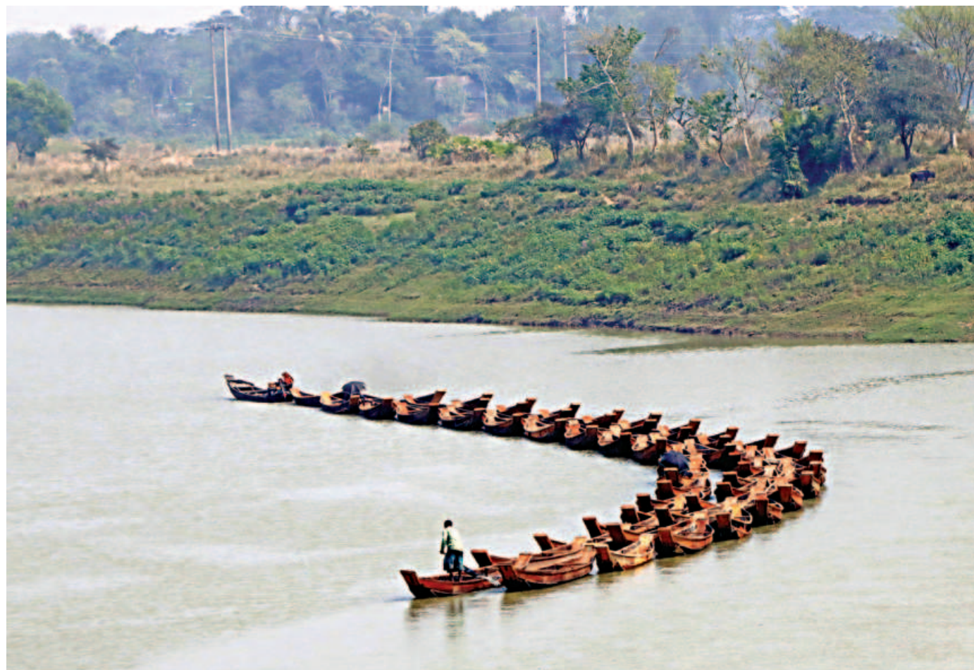
Small boats, locally known as Barki, are good for carrying pebbles and sand arrive in Sylhet's Jafiong and Jaintiapur. The photo of craftsmen taking their new boats to local markets on the Chengarkhal was taken last week.