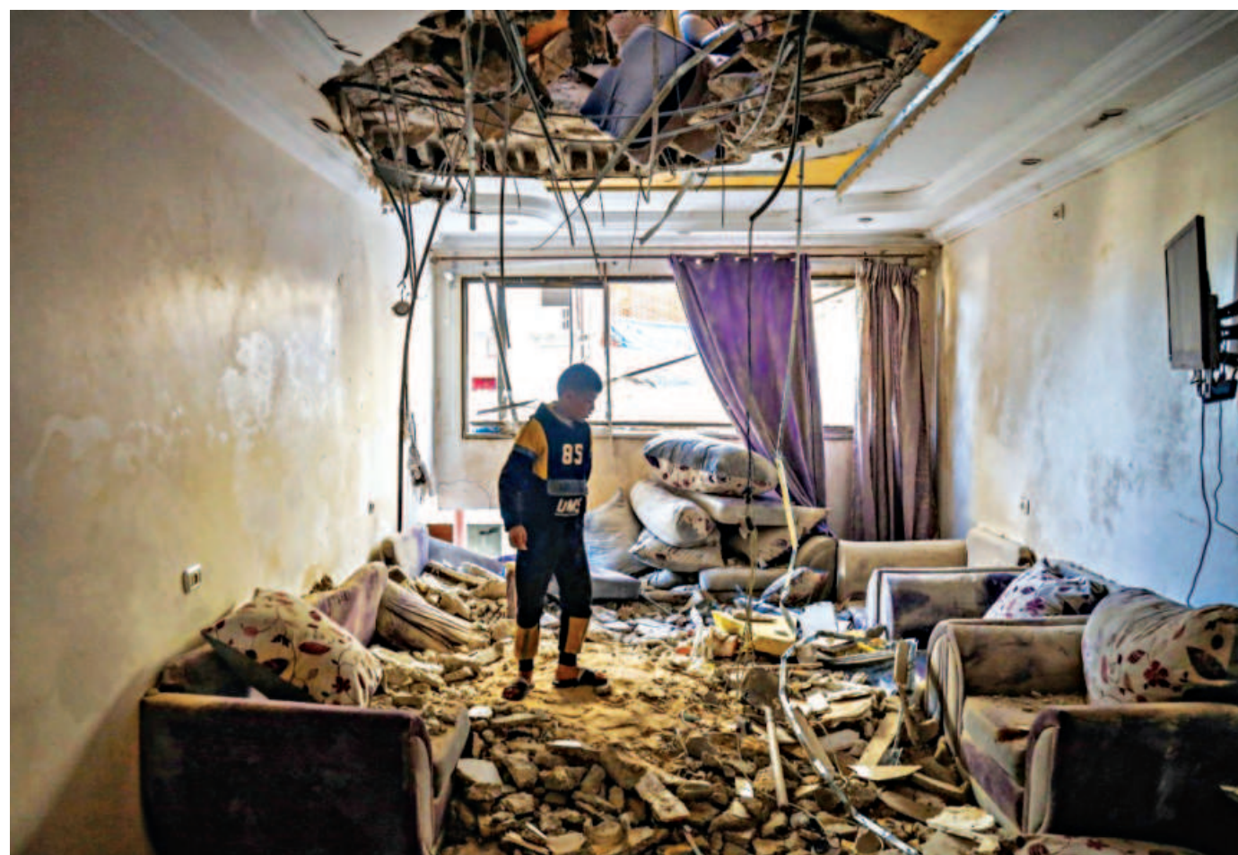
A Palestinian child stands in the living room of a building that was damaged during Israeli bombardment in Rafah, on the southern Gaza Strip yesterday.