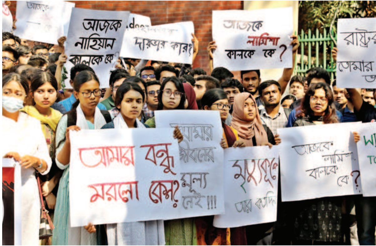
Students of BuEt demonstrate on campus as two of their classmates died in Thursday night's devastating fire at a building on Bailey Road.