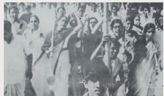
On March 3, 1971, women in Dhaka marched in solidarity with the nationwide strike.