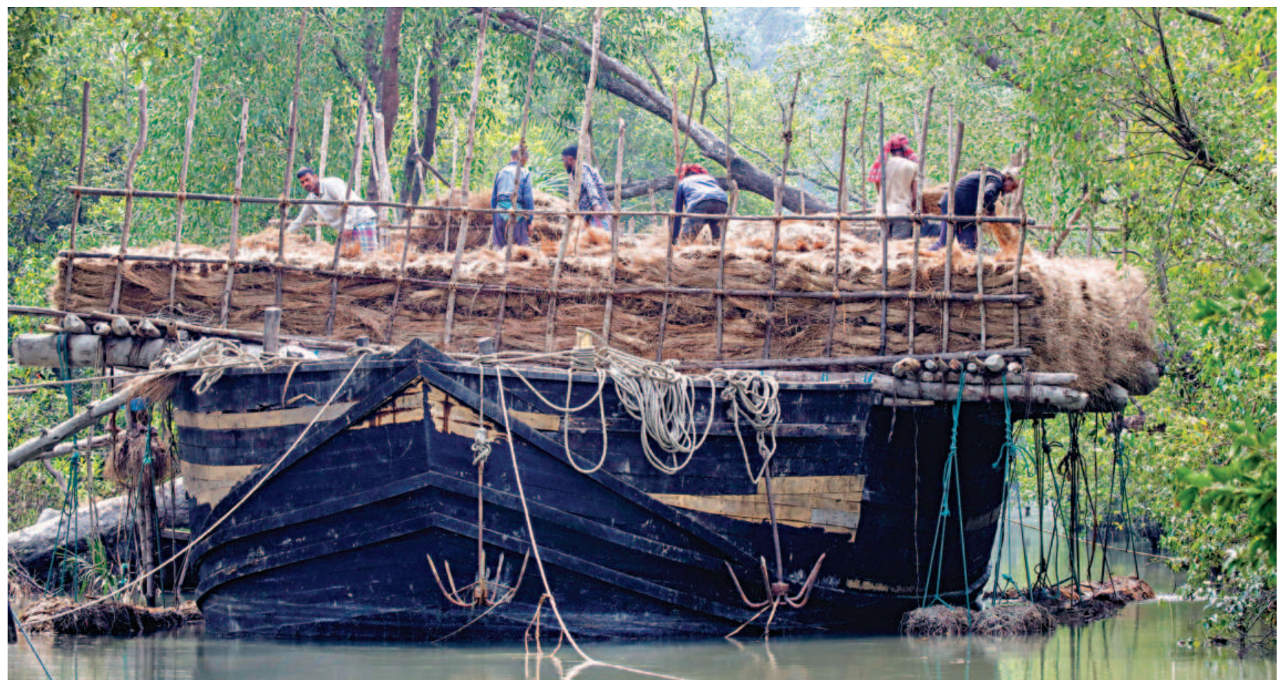
A large boat is being loaded with "chhon" or "shon," a type of tall grass found in the Sundarbans. To encourage new growth for deer grazing, authorities pay traders to remove mature grass from the mangrove forest. The grass is mostly used by villagers in Khulna and Bagerhat for various purposes, including building roofs of huts, fences in and around croplands, and as fuel for mud stoves. The photo was taken recently from the Kochikhali canal in the Sarankhola range of the Sundarbans.

SHAMSUDDOZA SAJEN At a meeting organised at Paltan Maidan, Bangabandhu Sheikh Mujibur Rahman urged the authorities to withdraw forces from the city and hand over power to the elected representatives of the people. He also called for launching a no-tax campaign. Bangabandhu, in an apparent reference to West Pakistan leaders, said: "If you do not want to frame one constitution let us frame our own constitution and you frame your own. Then let us see if we can live together as brothers." He appealed for communal peace and added the Biharis and non-Muslims "are our sacred trust". SEE PAGE 7 COL 6