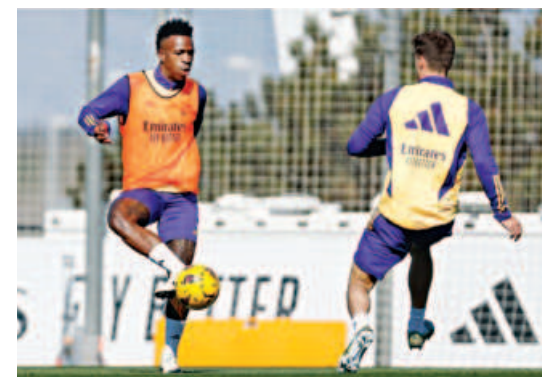
Real Madrid forward Vinicius Jr is all set to return to Mestalla for the first time since enduring racial abuse at the ground last year in May when Los Blancos will be taking on hosts Valencia in a LaLiga encounter on Saturday. Anticipating a fiery atmosphere, Spanish authorities declared the match as 'high risk' and ordered police reinforcements.