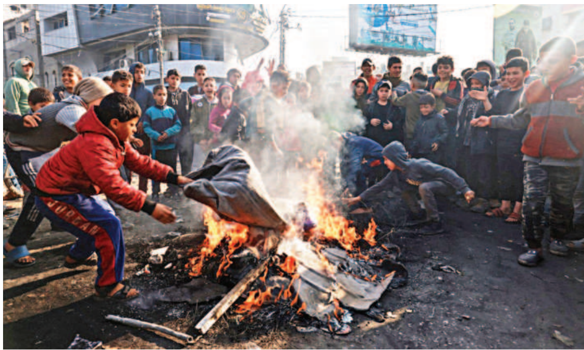
Palestinian children burn tires in protest against the rising prices of food and supplies due to shortages yesterday in the Rafah refugee camp in the southern Gaza Strip.

Waste prevention measures and improved waste management could reduce those costs.