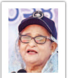
SEE PAGE 2 COL 2

Speaking at the inauguration of Police Week-2024 in Dhaka's Rajarbagh Police Lines yesterday, she outlined the vision of a developed and prosperous Bangladesh reliant on robust law enforcement. "Our operation against militancy, terrorism, drugs,