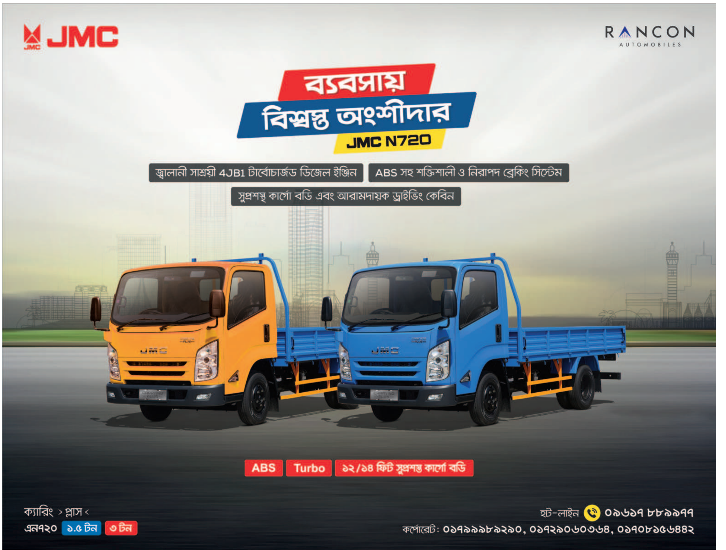
SEE PAGE 10 COL 3

Known as SLIM, or the Smart Lander for Investigating Moon, the robotic vehicle's