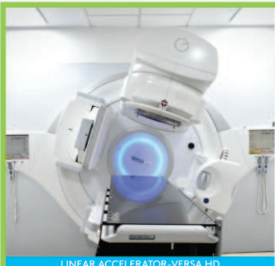
LINEAR ACCELERATOR-VERSA HD