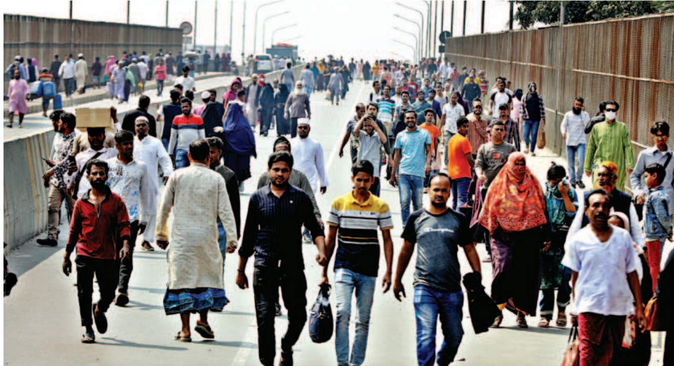
People walk across the First Buriganga Bridge in Postagola yesterday as the bridge has been closed to traffic since midnight Friday. The Road Transport and Highways Division announced that the bridge would be closed in phases until March 8 for restoration work.