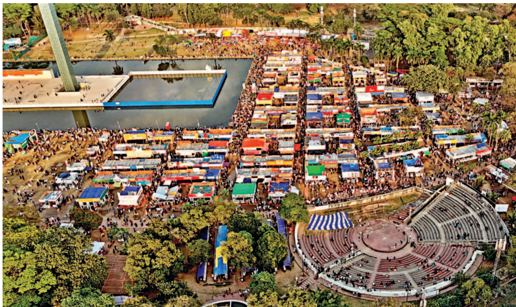
An aerial view of Amar Ekushey Bôi Mela at Suhrawardy Udyan. Yesterday was the last Friday of this month-long fair and a large number of people visited on the weekend. There are 764 bookstalls at the Suhrawardy Udyan and 173 on the Bangla Academy premises.