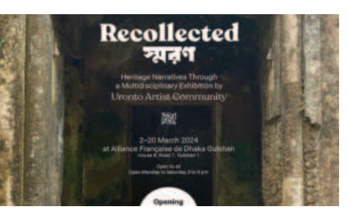
Multidisciplinary exhibition 'Recollected'

March 2 | 5pm - 11pm Alliance Française de Dhaka