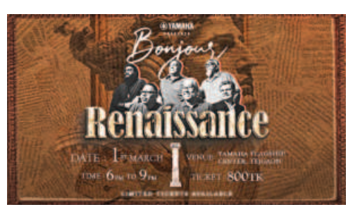
Bonjour Renaissance March 1 | 6pm - 9pm Yamaha Flagship Centre, Tejgaon

February 23 - 29 | 1pm - 9pm Chadni Studio, Banani