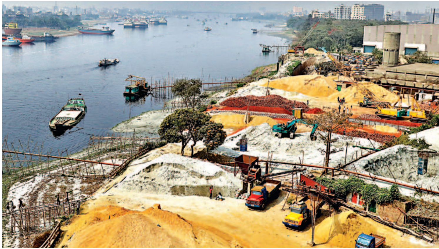
Mounds of sand piled past the demarcation pillars of the Burgianga river in Narayanganj's Pagla area. The sand is brought by boats and dumped through pipes on the river bank. Even though the river is vital to their business, the sand traders encroach on it, reducing navigability and harming the environment. The photo was taken on Thursday.