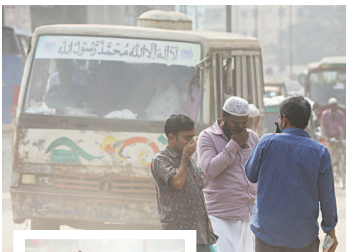
People on the street covering their faces as dust kicked up by vehicles shroud the neighbourhood in Nayabazar area of the capital yesterday. Poor air quality in the city has made headlines in recent weeks.