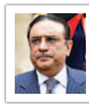
Asif Ali Zardari