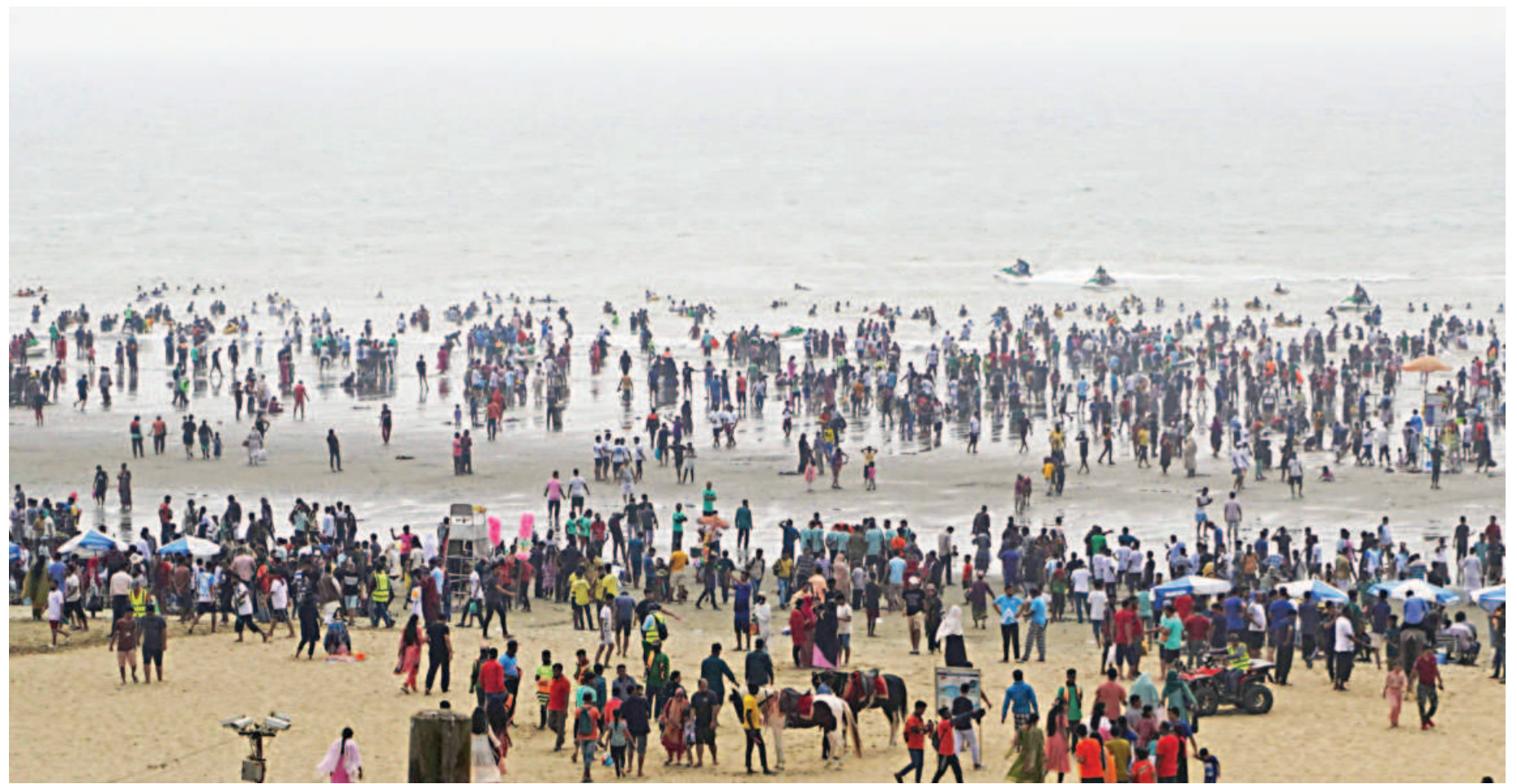
A crowded sea beach in Cox's Bazar as offices were closed yesterday, the International Mother Language Day. Some people have taken the day off today to enjoy a four-day weekend. Bangladesh Railway arranged a special train between Dhaka and Cox's Bazar on Tuesday to meet the high demand.

Diesel and crude oil would be transported from floating moorings in the sea to the storage tank terminal at Moheshkhali through two 16 km long pipelines of 36 inches width. From the storage tank, two other pipelines of 94 km in length and 18-inch width will transport the fuel oil to the Eastern Refinery in Chattogram.