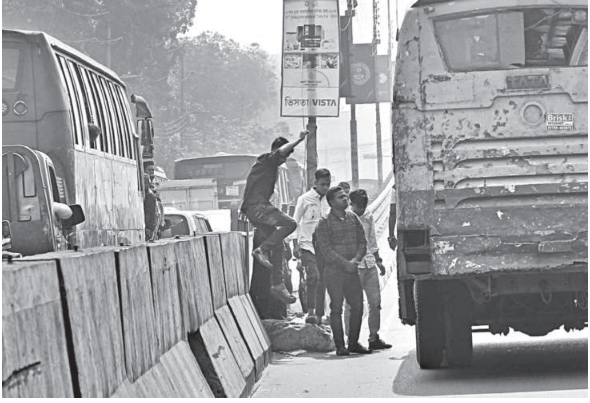
Risking life, a man jumps over a median on Mohakhali flyover to get on a bus. Violating traffic rules, many bus drivers drop off and take in passengers in the middle of flyovers. The photo was taken Tuesday afternoon.

Bangladesh embassies Language Day, spreading in Italy and the Philippines the message of respecting also organised similar languages and cultures and events marking the day.