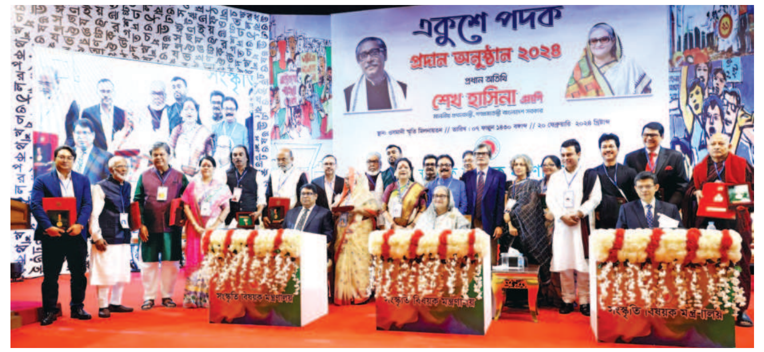
Prime Minister Sheikh Hasina poses for a photo with the Ekushey Padak recipients at Osmani Memorial Auditorium in the capital yesterday.