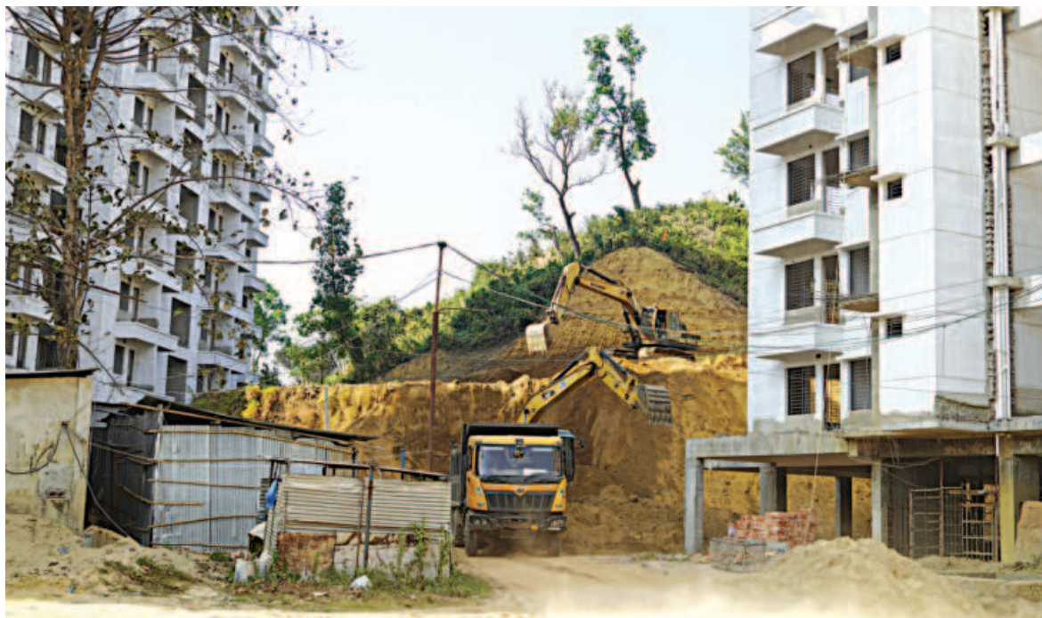
The Cox's Bazar Development Authority has allegedly been cutting some hills inside its high-rise residential apartment project in Kolatoli area of Cox's Bazar town and dumping the earth at a low land in front of the project area. The photo was taken yesterday.

"When he left for Saudi Arabia, our family was facing hardship. As he