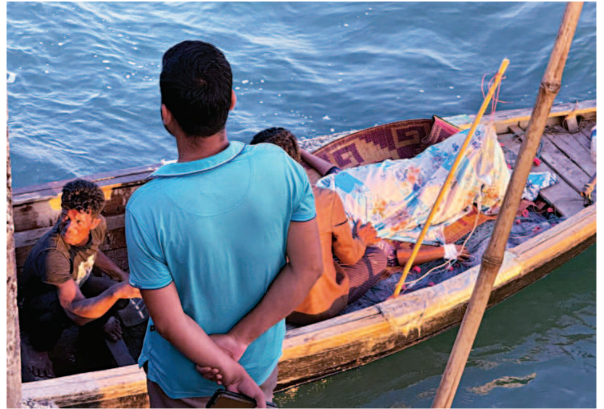
Five Rohingyas, including a bullet-hit woman, arriving at the Shahporir Dvip jetty in Cox's Bazar's Teknaf upazila yesterday. They are here to seek refuge and treatment as fighting between the Myanmar troops and Arakan Army rages across the border.