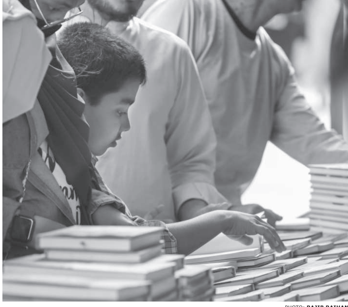
A young boy lost in the verses of a novel at Ekushey Boi Mela in the port city's CRB area. The fair witnessed a promising turnout this weekend, bringing together readers across ages and backgrounds.

Mohammad Hasan Arif Central Medical Stores Depot (CMSD)