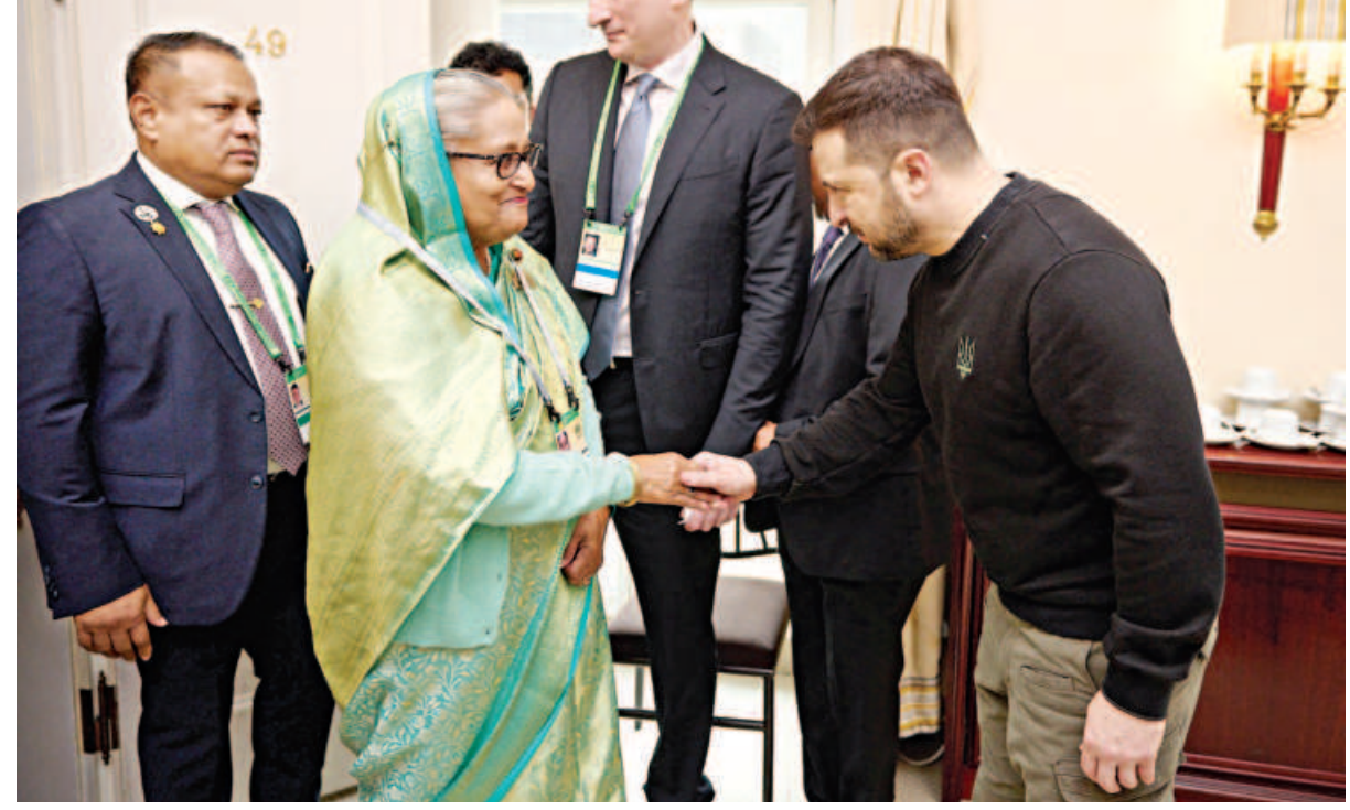
llkraine's President Volodymyr Zelenskiy greets Prime Minister Sheikh Hasina hefore their meeting at the Munich Security Conference yesterday.