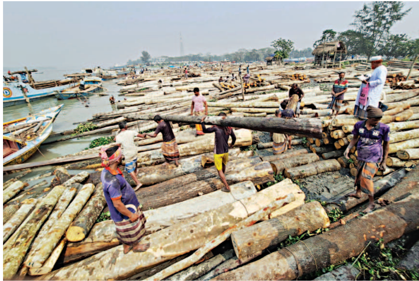
The bank of the Shondha in Pirojpur glows with the sun's rays, as lumberjacks unload logs brought from different districts in Barishal. Furniture makers from across the country source timbers from this place which has come to be known as Kathmahal. The photo was taken last week.