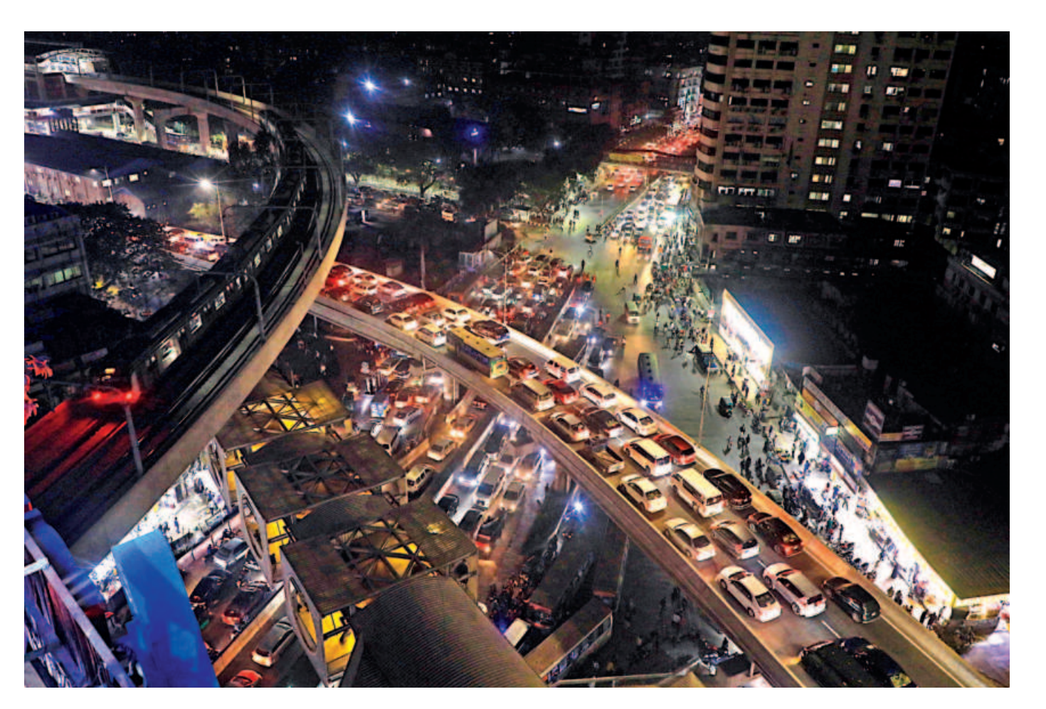
Standstill traffic on all streets, including the Dhaka Elevated Expressway, at Farmgate in the capital last night. Many city dwellers said people going out in droves on a weekday to celebrate Pahela Falgun, Valentine's Day and Saraswati Puja, which coincided, caused citywide gridlocks.

The Myanmar nationals -- which comprise security and BGP personnel, police and immigration officials started fleeing to Bangladesh on February 4 as the ongoing fighting between the junta forces and a rebel group called Arakan Army escalated SEE PAGE 12 COL 4