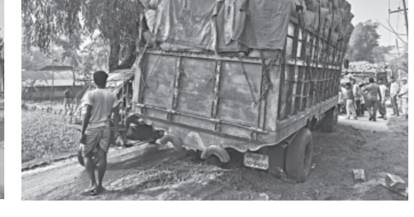
The 1,170-metre-long Payra bridge on the Dhaka-Patuakhali highway was built at a cost of Tk 1,118 crore. However, countless truck drivers are choosing to use an alternative route to avoid being fined for overloading their vehicles. As a result, local roads and bridges in Patuakhali and Mirzaganj are left in an unfit state, due to continuous plying of overloaded trucks.