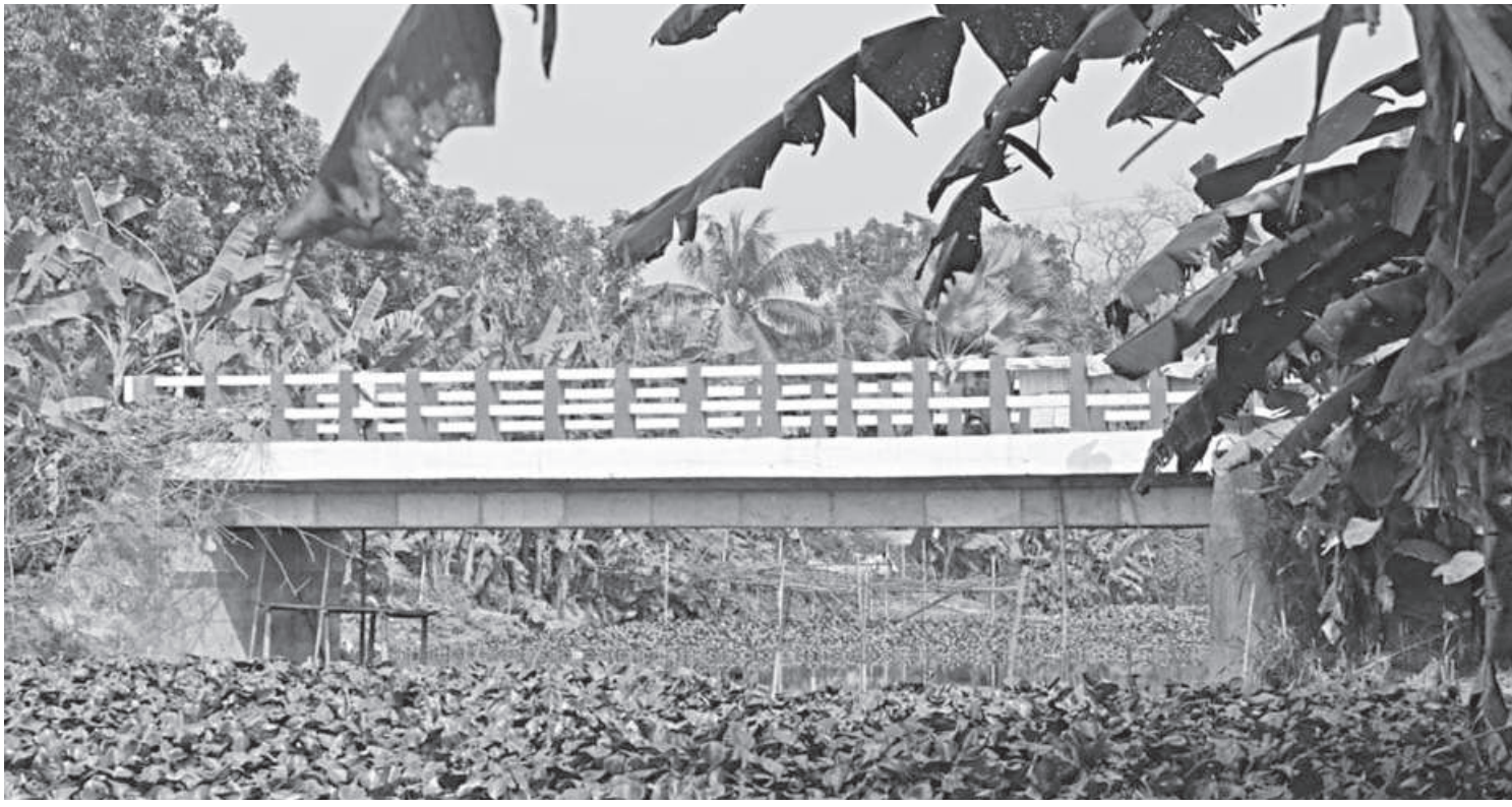
A 15-metre long bridge constructed on the Ichhamati river by narrowing down the waterbody from both ends. Four other such unplanned structures have been built on the river, destroying its natural flow and navigability.