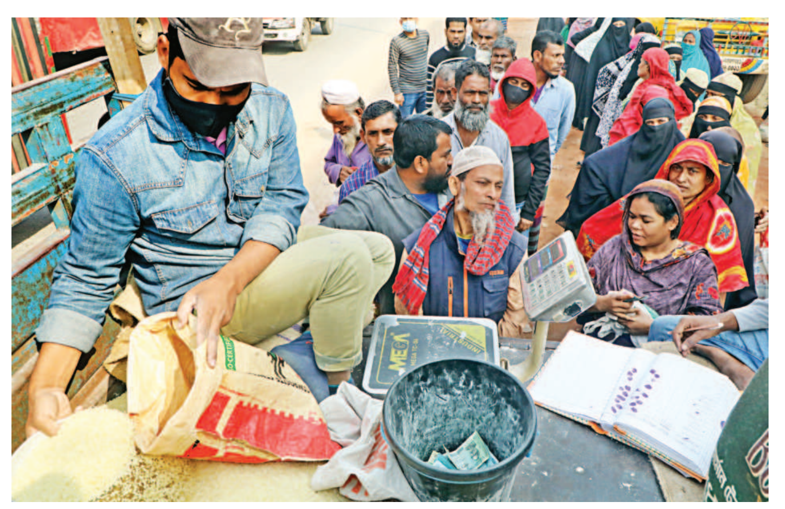
Locals queue up in front of an OMS truck on the capital's Bosila road to buy essentials at subsidised prices. Each buyer can purchase 5kg of rice for Tk 30 per unit while flour, with same allotment per head, is sold for Tk 24 per kilo. The goods are packed and handed over after they show their NID and sign their names in a register book.

the absolute imperative of capping temperature increase to 1.5 degrees Celsius," he said, asserting that we must solve the problem of climate change faster than we are creating it.