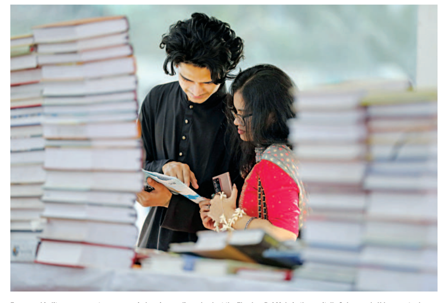
Engrossed in literary verses, two young minds enjoy reading a book at the Ekushey Boi Mela in the capital's Suhrawardy Udyan yesterday